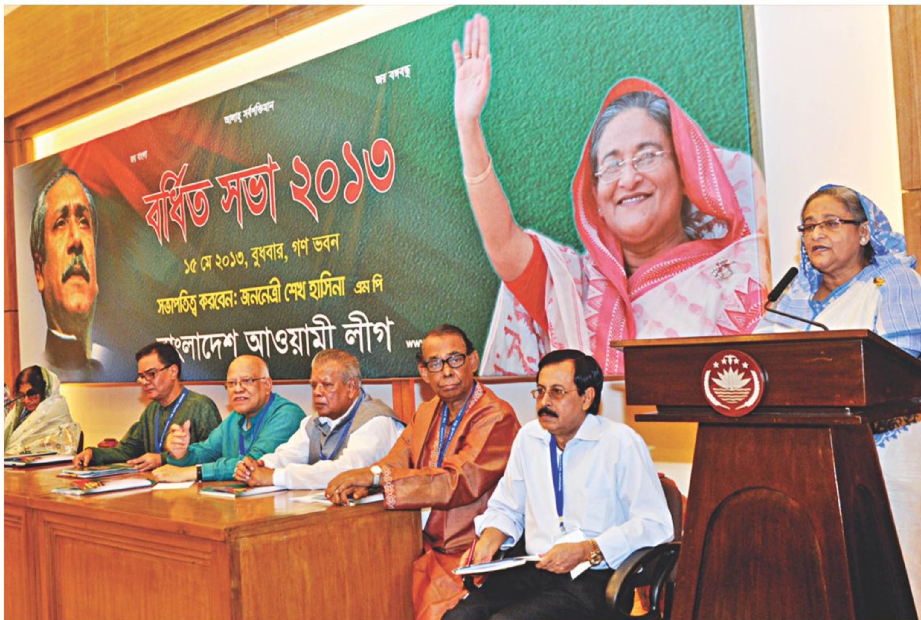
Prime Minister and Awami League President Sheikh Hasina addresses an extended meeting of the party at Gono Bhaban yesterday.