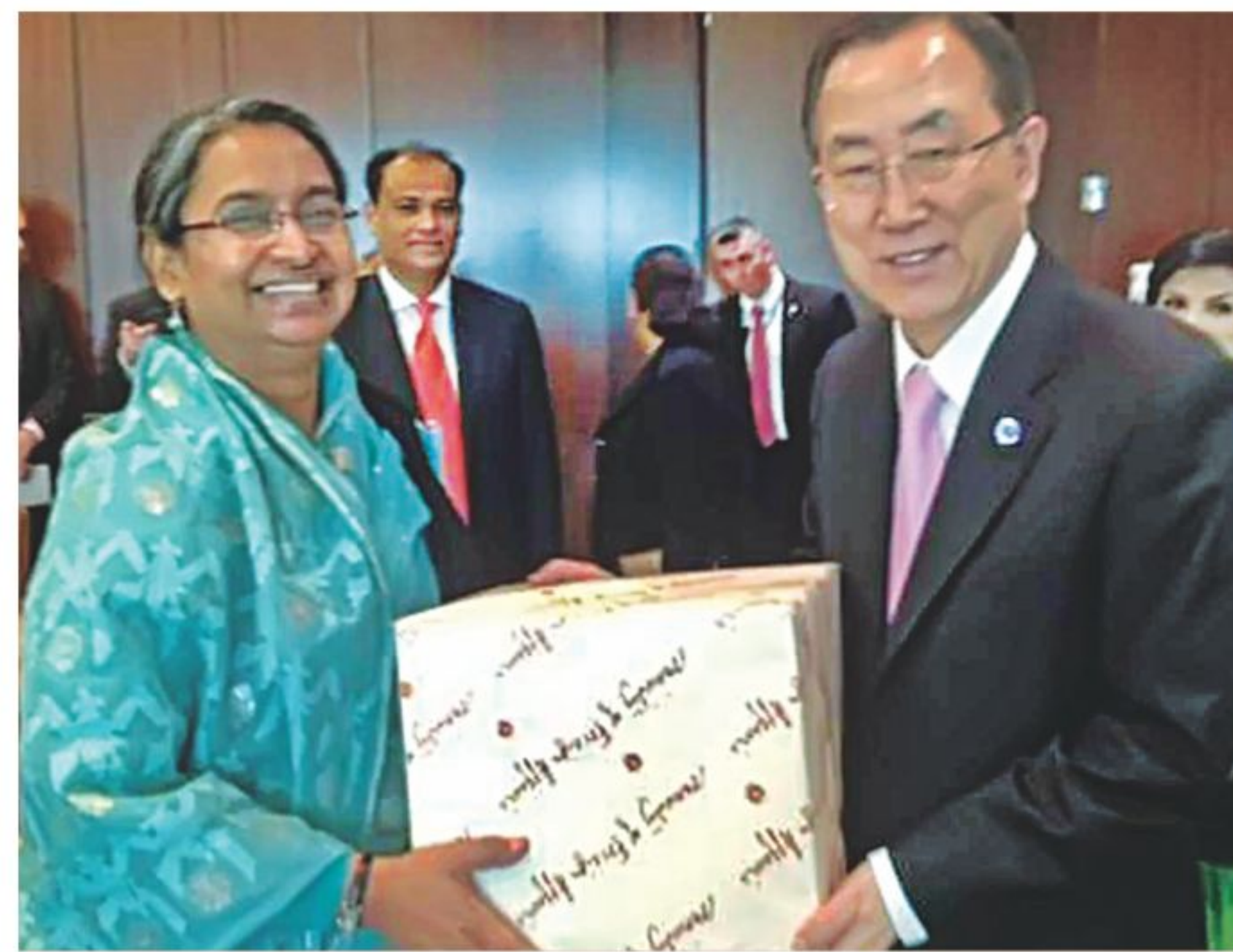
Foreign Minister Dipu Moni meets UN Secretary-General Ban Ki-moon at the UN Headquarters in New York on Monday.