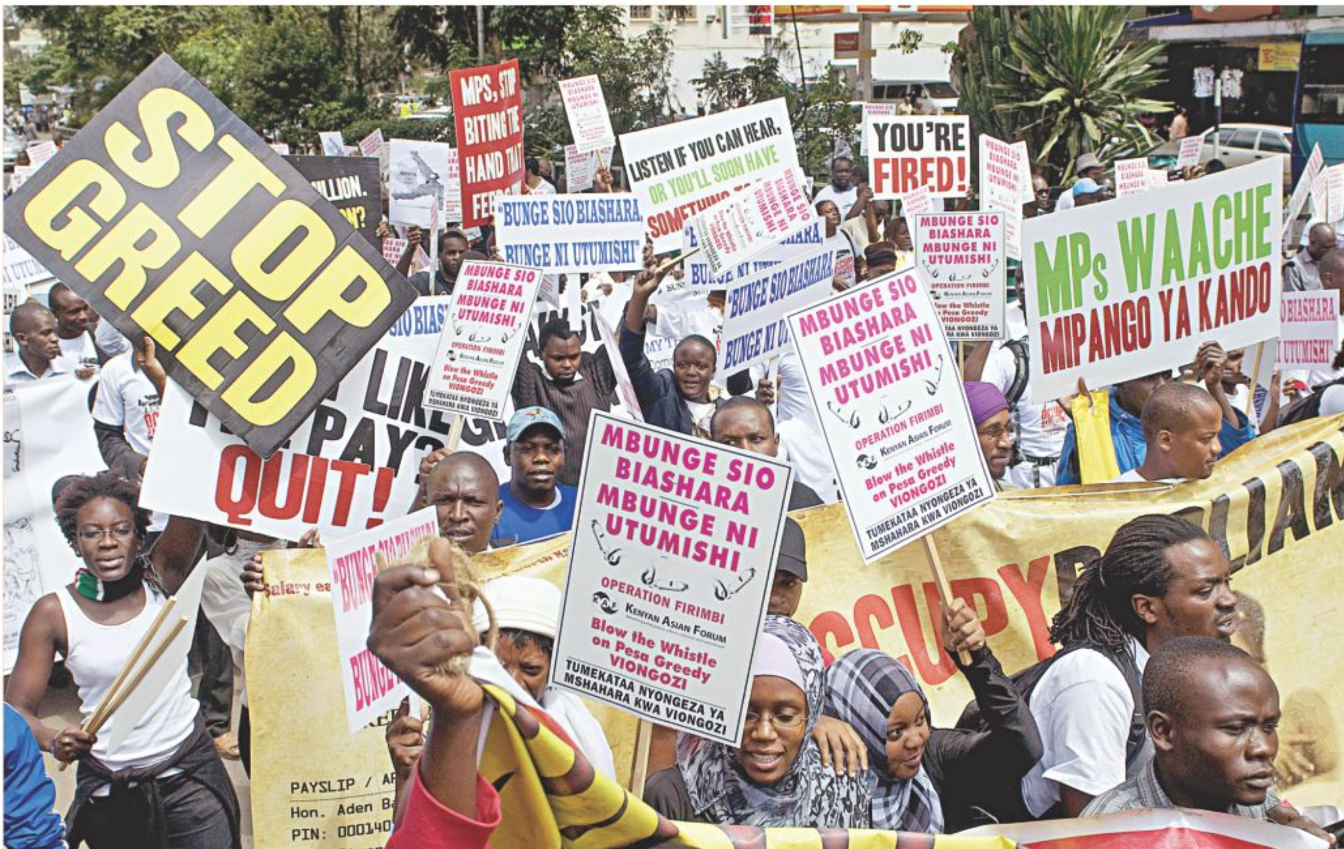
Protestors carry placards as they march to parliament in Nairobi yesterday as they protest a scheme by Kenya's new MPs to increase their salaries. Symbolising MPs' greed the protestors carried live pigs to the gates but were later dispersed by police using teargas and water cannon.

The man then stands up, raises his dagger in one hand and the heart in the other and raises it to his mouth before the video abruptly ends.