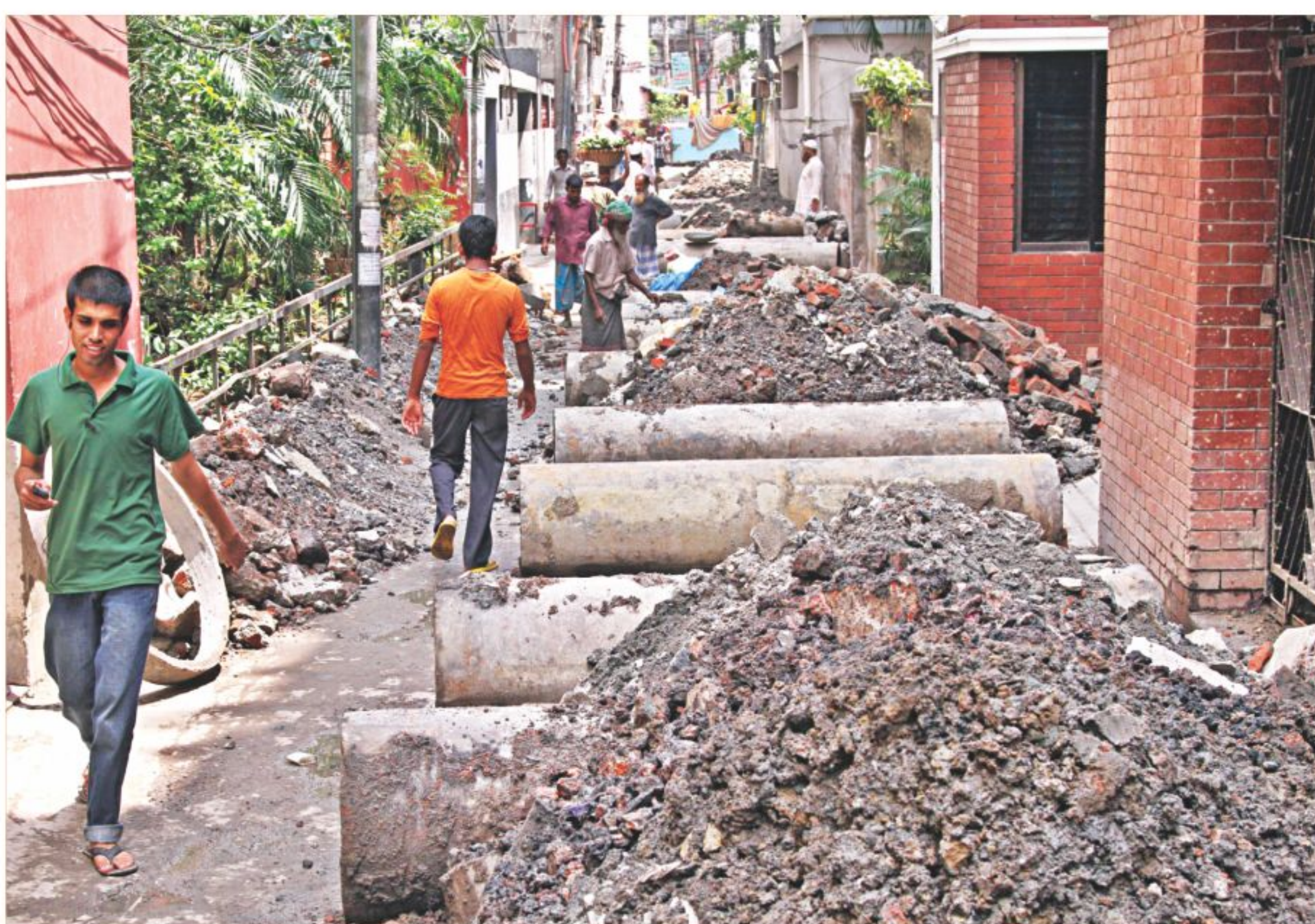
Drainage works during the monsoon create difficulties for pedestrians in the capital's New Elephant Road area. The photo was taken yesterday.

The husband of the woman was not at home when the incident happened.