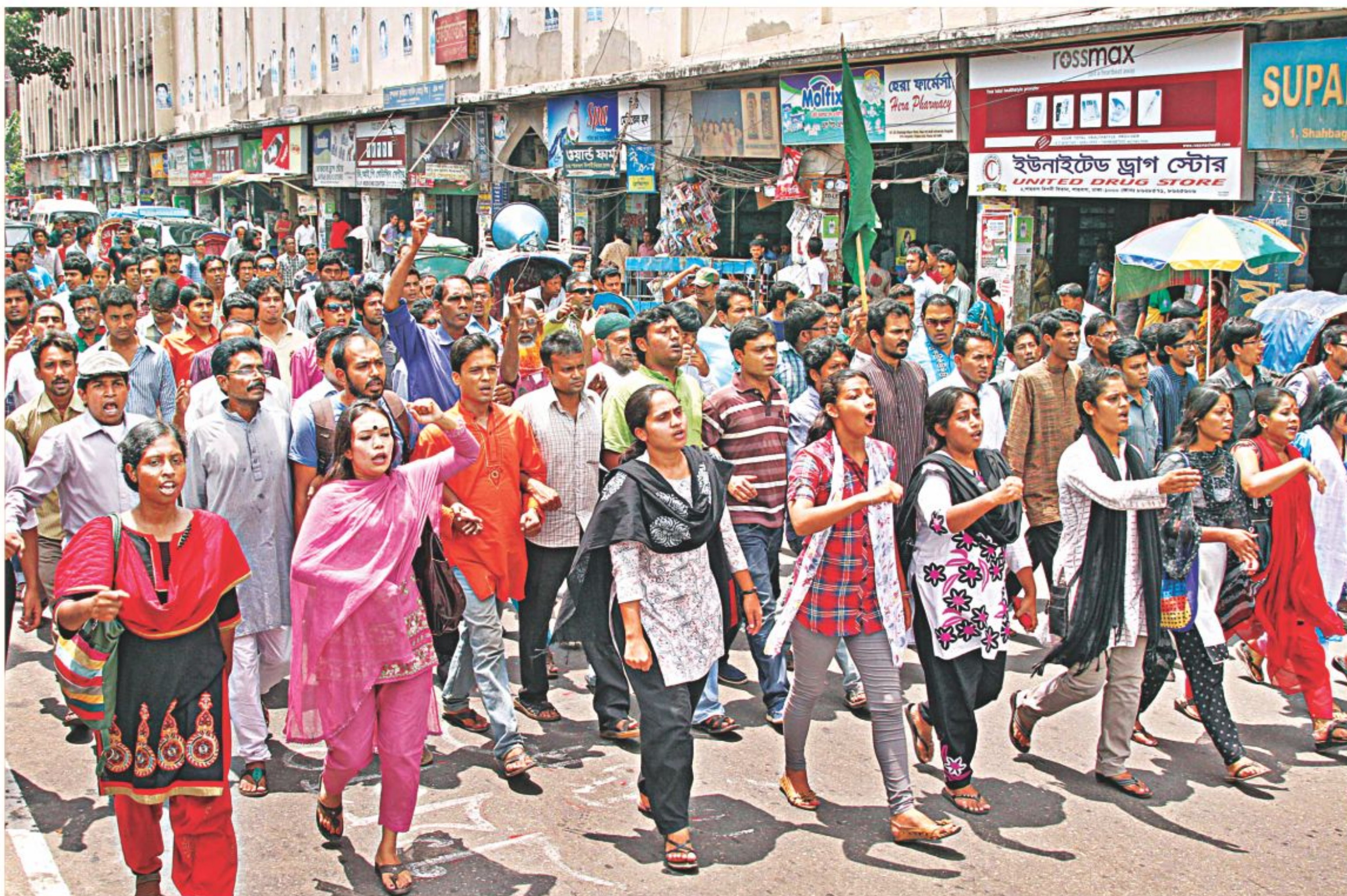
Gonojagoron Mancha brings out a procession from Shahbagh in the capital yesterday protesting the hartal called by Jamaat-e-Islami.