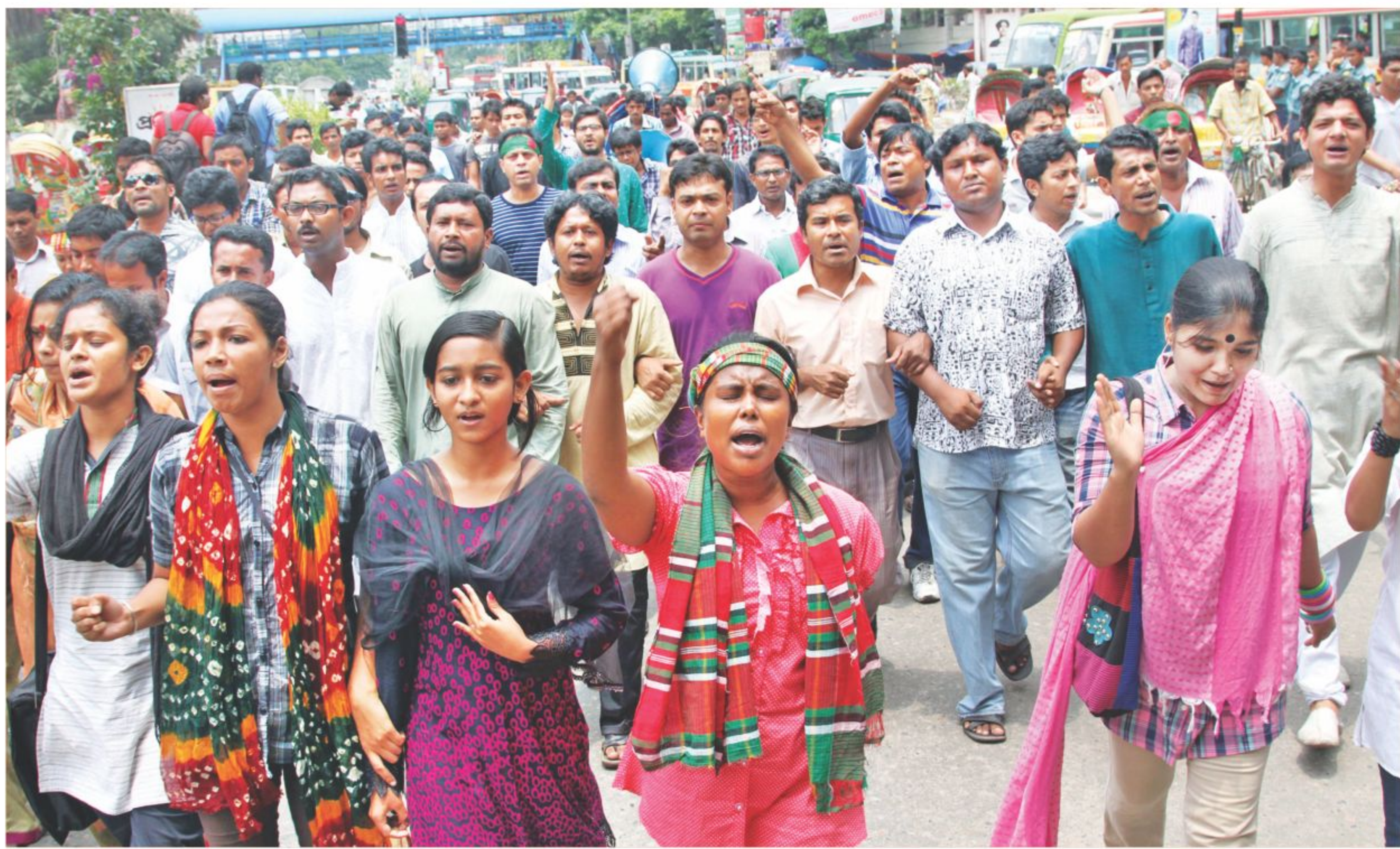
Youths of Gonojagoron Mancha bring out an anti-hartal procession from Shahbagh intersection in the capital yesterday.

The students were given Tk 850 monthly with a yearly raise of Tk 50 during their 48-month-long course.