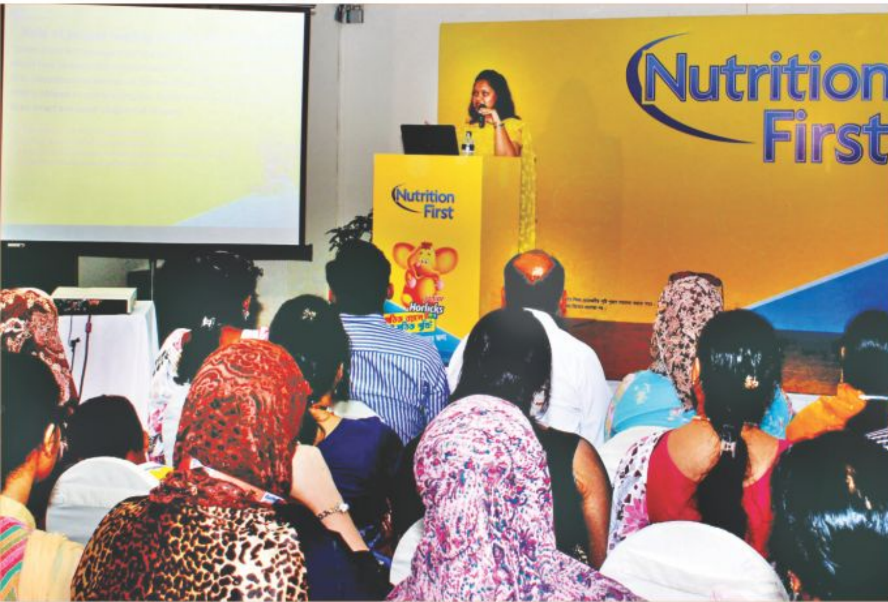
Participants at a Teachers' Meet programme organised by consumer health care company GlaxoSmithKline (GSK) at Pan Pacific Sonargaon Hotel in the capital on May 10, to raise awareness among teachers about health and nutritional necessities of students.

A policy is being formulated regarding import of 5,000 new CNG-run auto-rickshaws for Dhaka and Chittagong cities, Quader also informed.