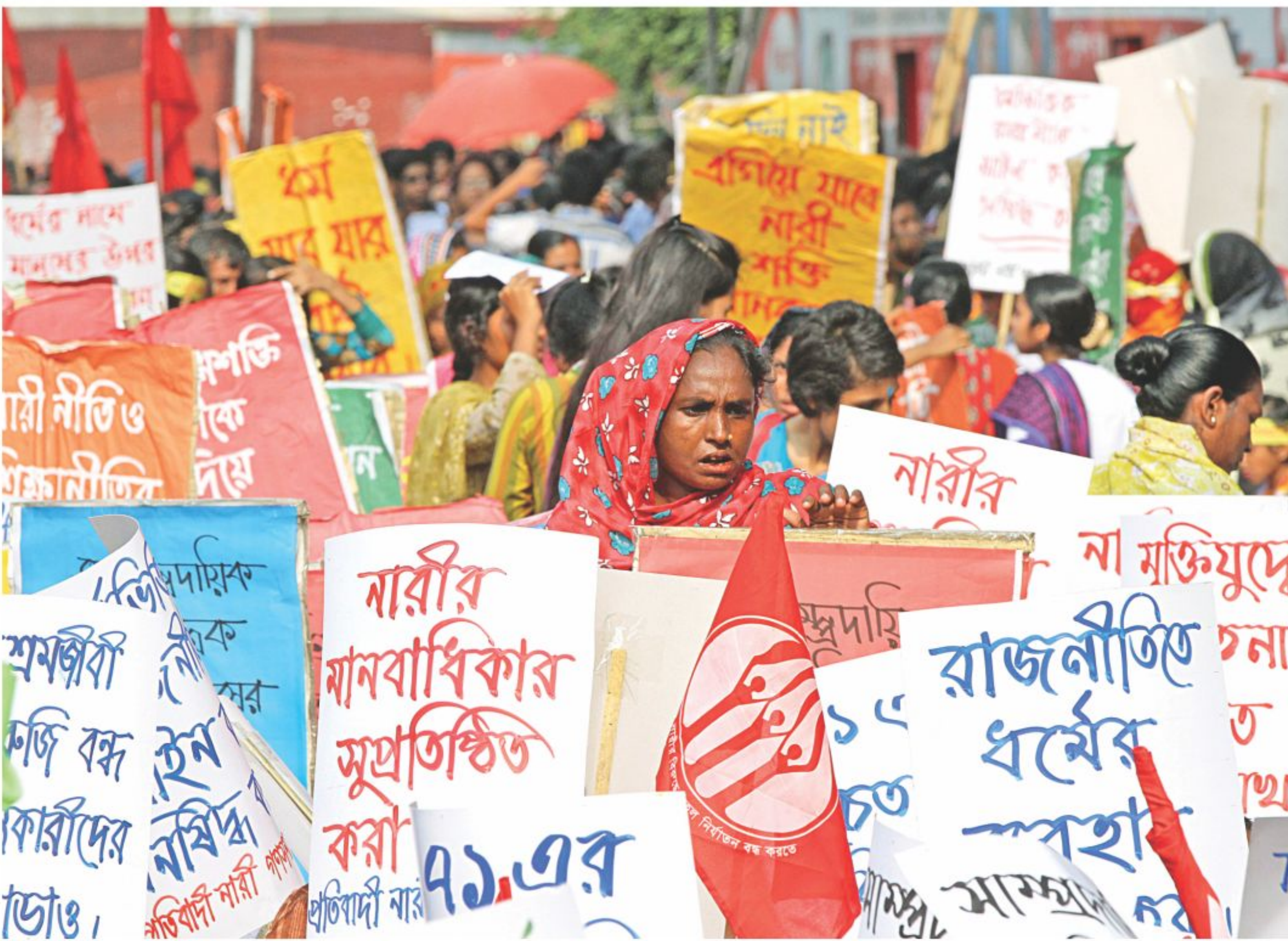
Women of all walks of life hold a protest rally before the Jatiya Press Club in the capital yesterday demanding a secular Bangladesh with gender equity. Various social and cultural bodies organised the rally.