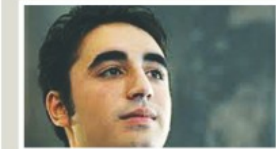
Pakistan People's Party 35