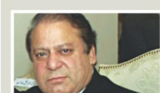
Pakistan Muslim League (N) 117 (leading in)

Imran Khan's party concedes defeat, to 'form govt in northwest'; voters defy violence as 29 killed