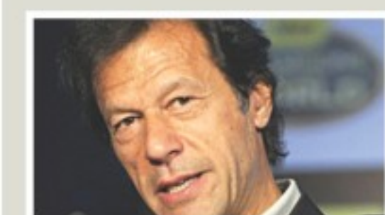
Pakistan Tehreek-e-Insaf 34