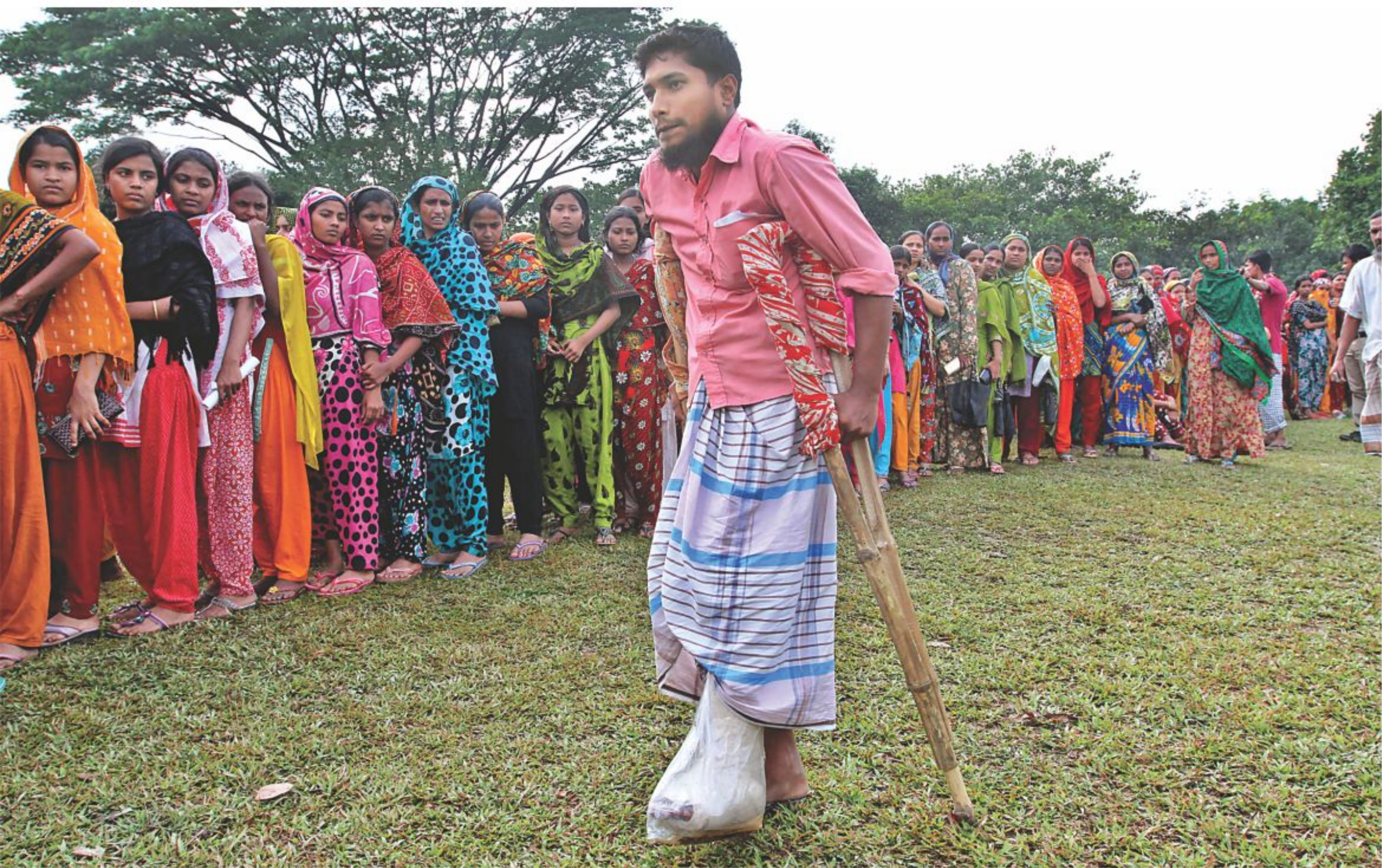
A man, injured in the April 24 Rana Plaza collapse, walks on crutches past a queue of his fellow workers at Savar cantonment yesterday. The workers, all from the garment factories housed at Rana plaza, came here to receive wages and benefits from Bangladesh Garment Manufacturers and Exporters Association (BGMEA).