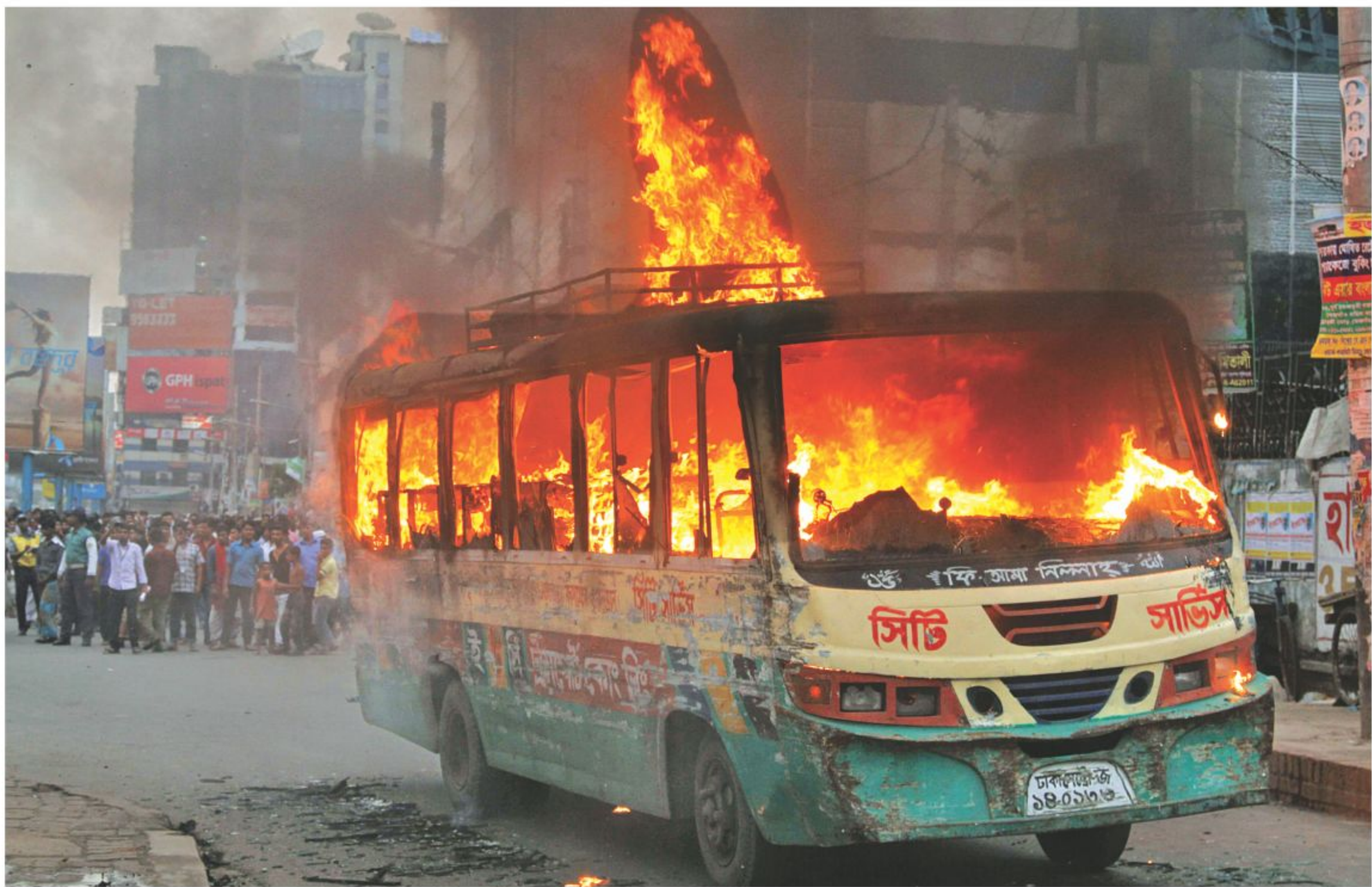
A bus set alight on Kazi Nazrul Avenue in the capital yesterday, on the eve of an opposition shutdown.