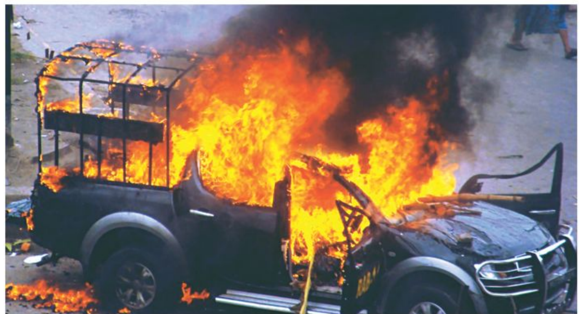
A Rapid Action Battalion vehicle burns at Siddhirganj of Narayanganj yesterday during law enforcers' clash with Hefajat-e Islam.