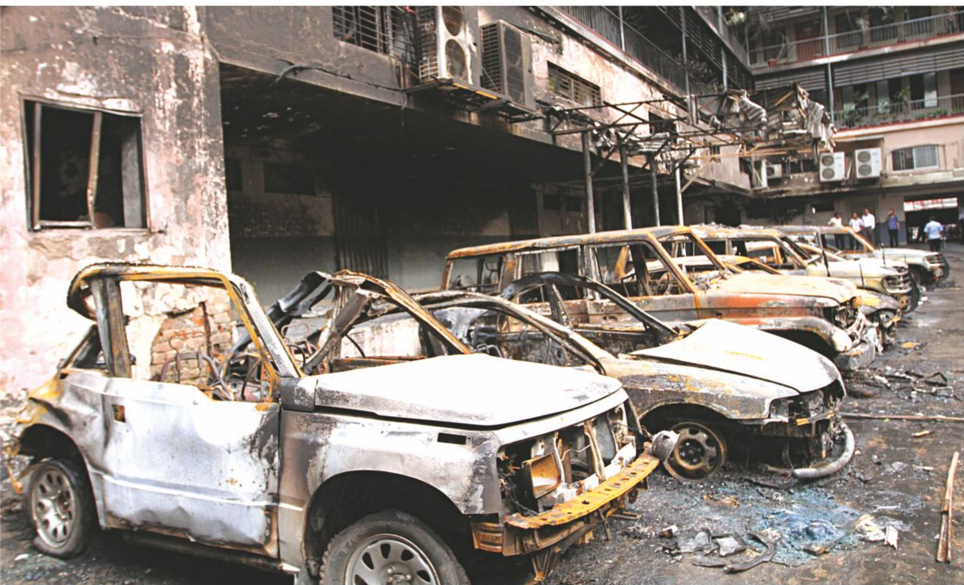
The wreckage of parked cars at House Building in Motijheel yesterday. They were all burnt on Sunday during the Hefajat-e Islam rampage in the area.