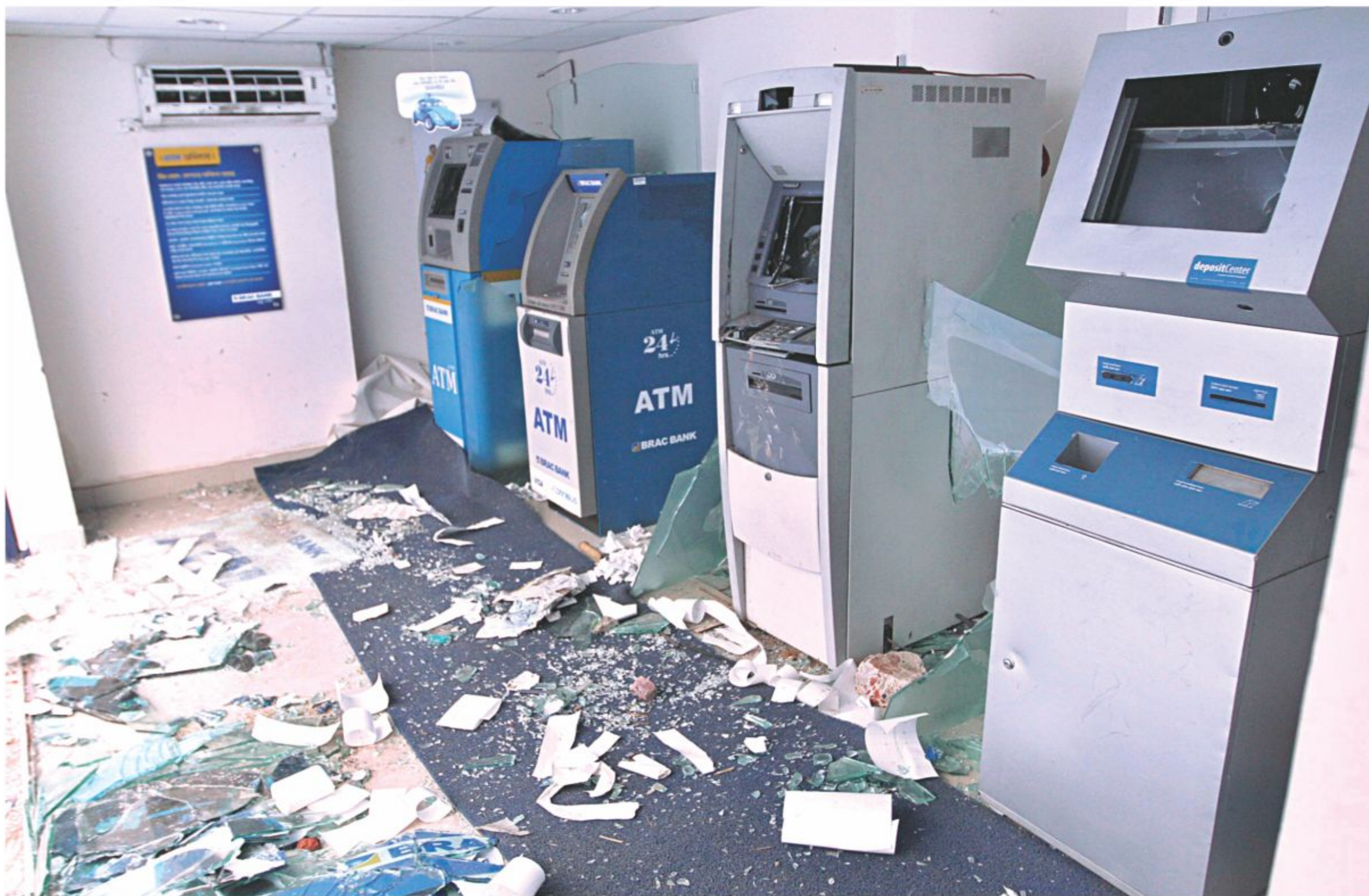
The ATM booth of Brac Bank at Motijheel was vandalised and attempts had been made to loot the cash during Sunday's violence centring on the Hefajat-e Islam rally.