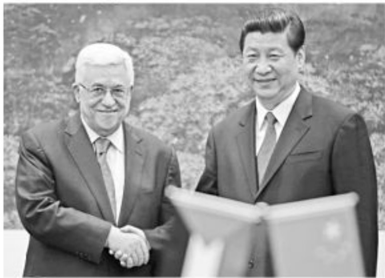
Xi Jinping shakes hands with Abbas

China yesterday implicitly criticised Israel's air strikes in Syria as Prime Minister Benjamin Netanyahu and Palestinian President Mahmud Abbas both visited the country to meet top leaders.