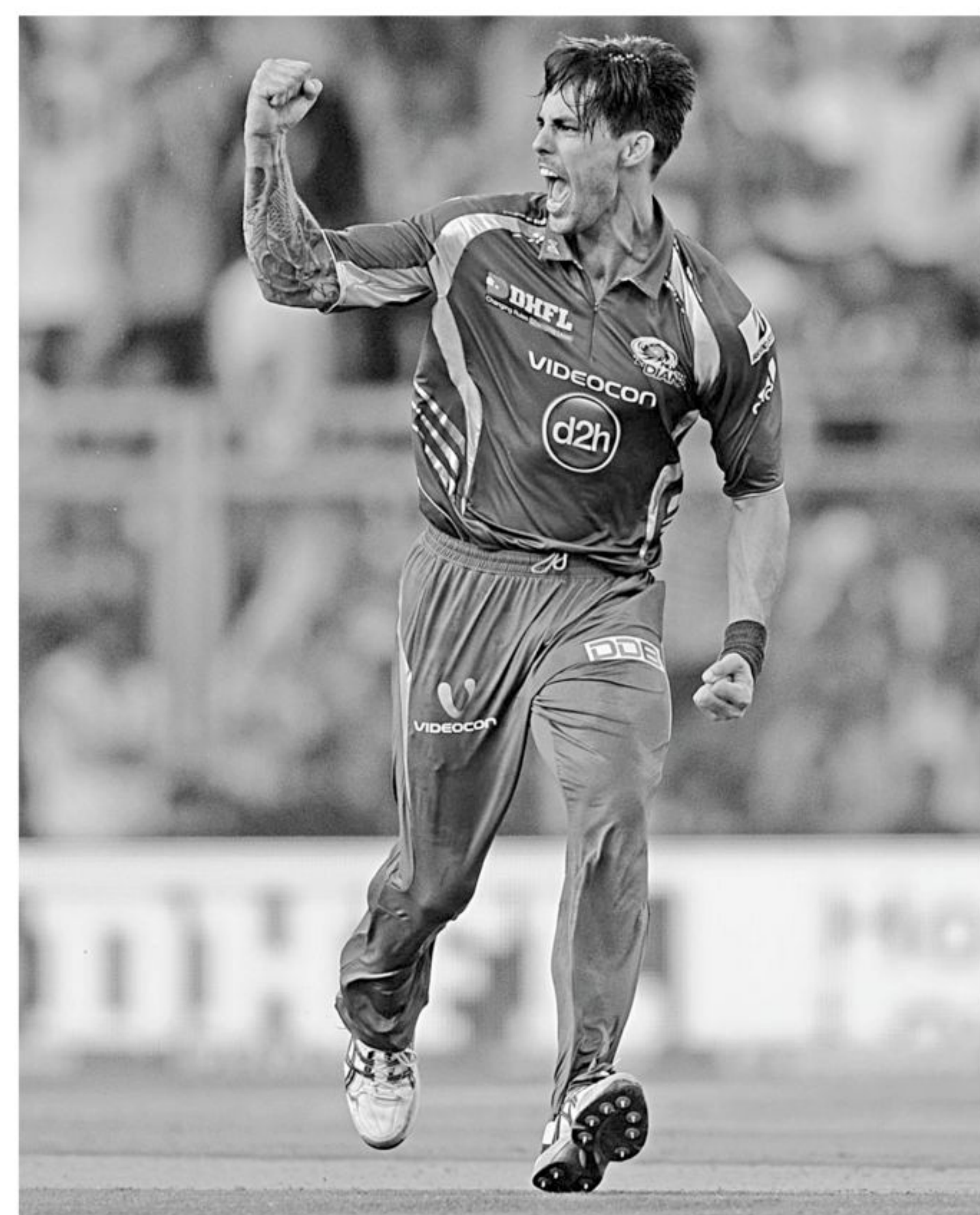
Mumbai Indians pacer Mitchell Johnson celebrates one of his three Chennai Super Kings wickets during their Indian Premier League match at the Wankhede Stadium in Mumbai yesterday.