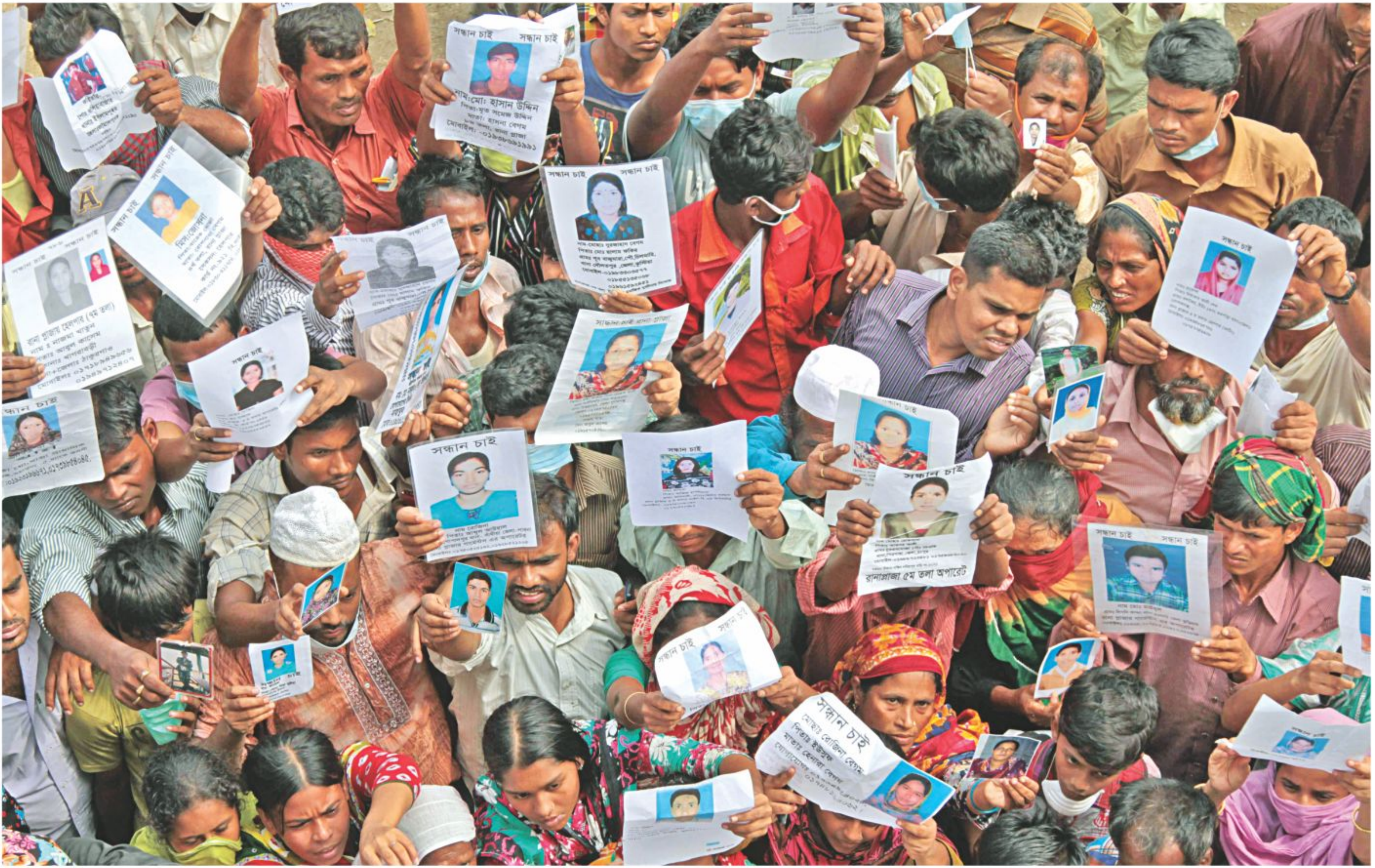
Relatives of victims yet to be rescued or recovered hold their photos high at Adhar Chandra High School playground in Savar so that rescuers who are bringing in bodies can identify them.