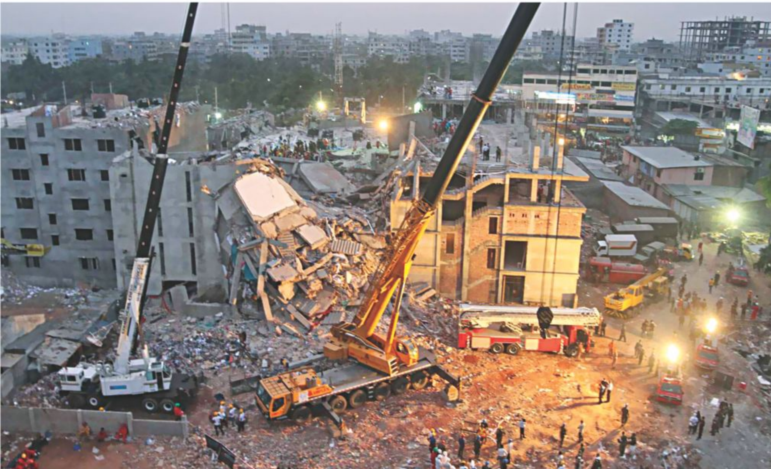
A photo of the Rana Plaza disaster taken from the rear of the building at Savar bazaar bus stand yesterday. A few cranes have been deployed to move the rubble. The nine-storey building collapsed on Wednesday morning, killing over 380 people, mostly garment workers.