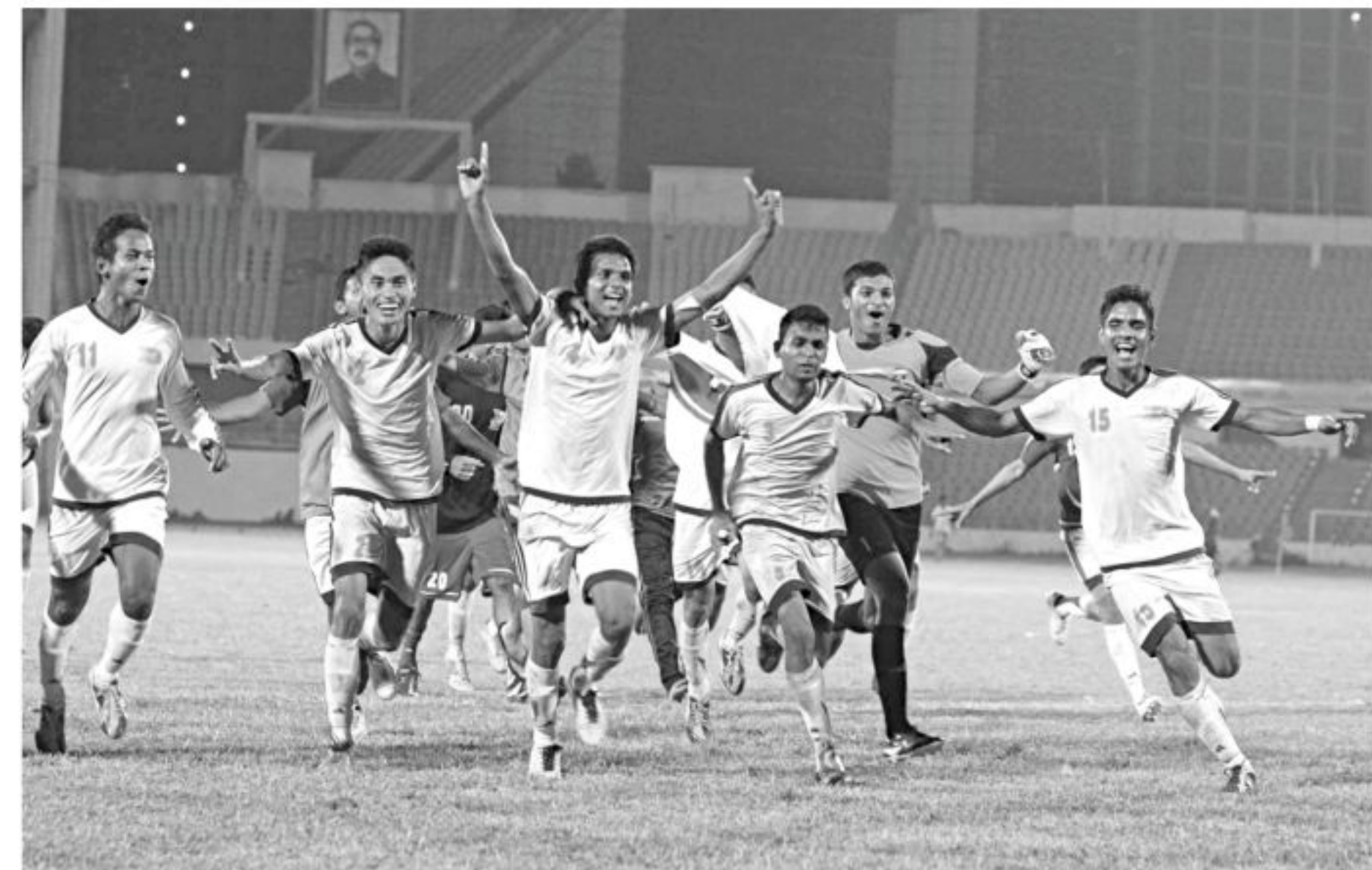
BKSP players run for joy after winning the Bangladesh Games' football gold defeating Barisal 2-1 in the final at the Bangabandhu National Stadium yesterday.