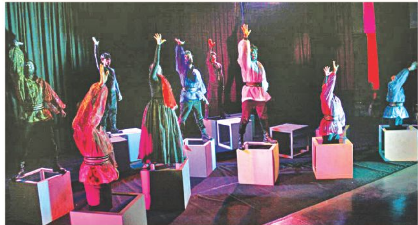
"Macbeth" -- one of the most powerful works of Shakespeare -- is a fitting tribute on the bard's birthday.