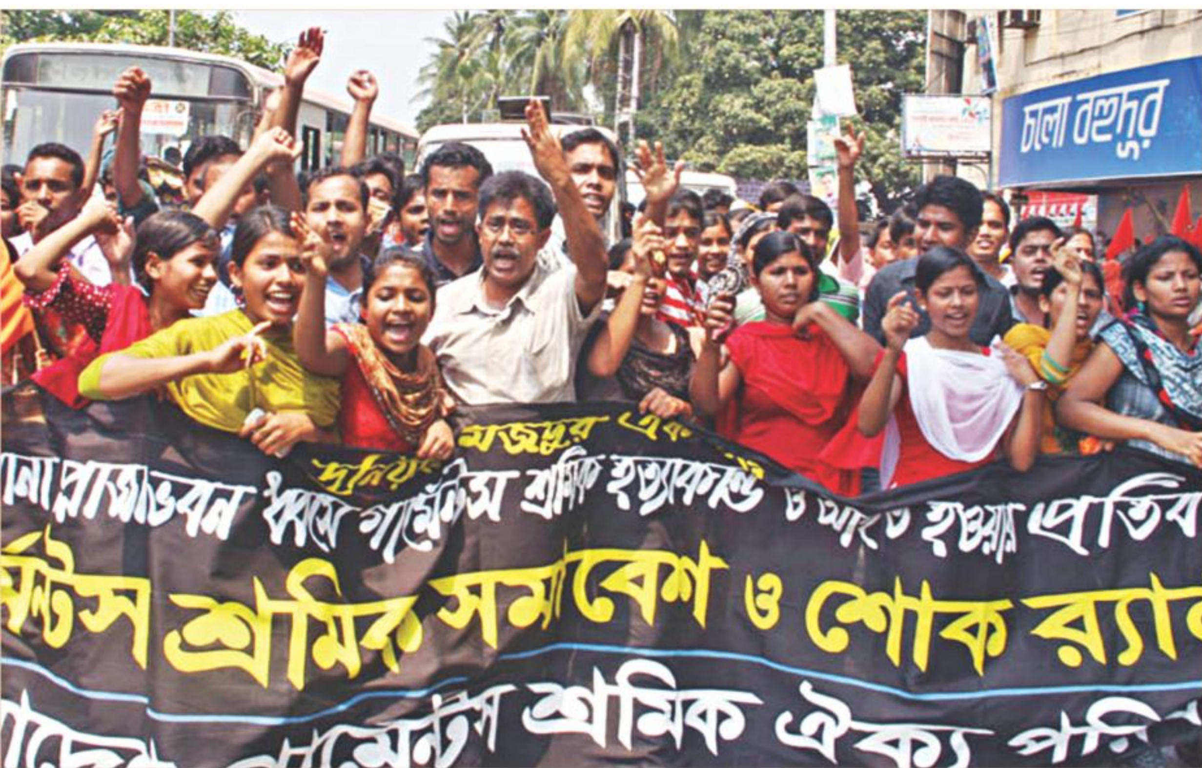
Bangladesh Garments Sramik Oikya Parishad demonstrates before the Jatiya Press Club in the capital yesterday protesting the Savar tragedy.