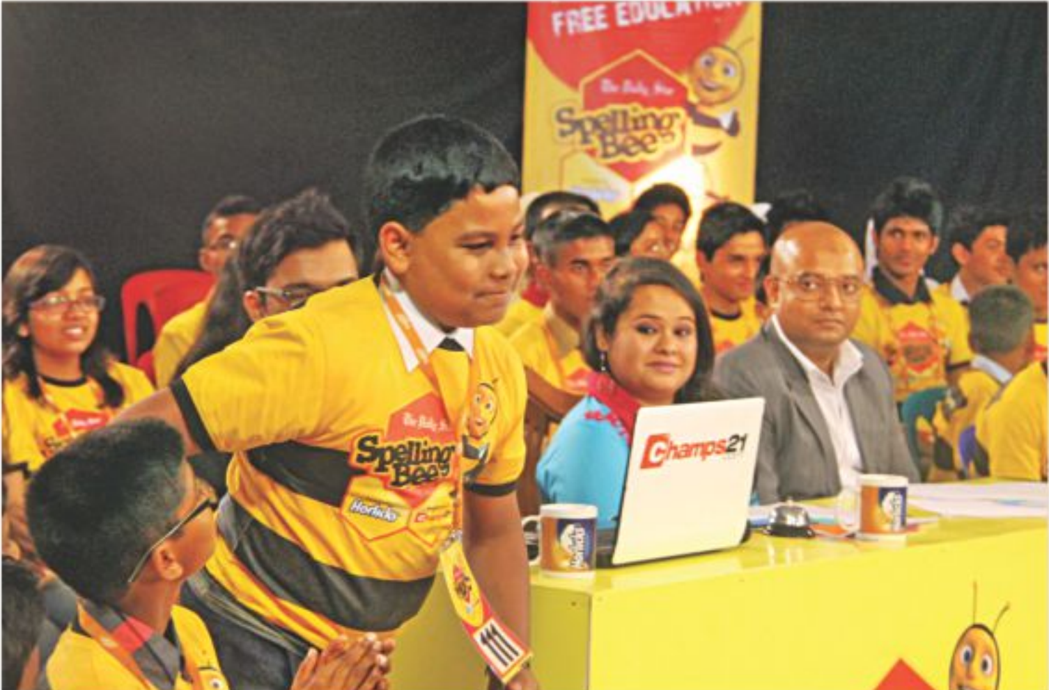
An enthusiastic participant steps up to the spelling challenge.

“Such was the positive response and impact the Spelling Bee had in its first season, even though we did not visit the Division last year. The Rajshahi and Rangpur Divisional Round qualifiers had to come to Rajshahi last time around. But