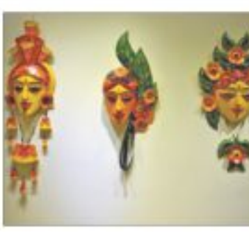
Mask Exhibition Title: Masks of Bangladesh Venue: Gallery Jhongs, Niketan Date: Apr 12-25 Time: 10am-8pm