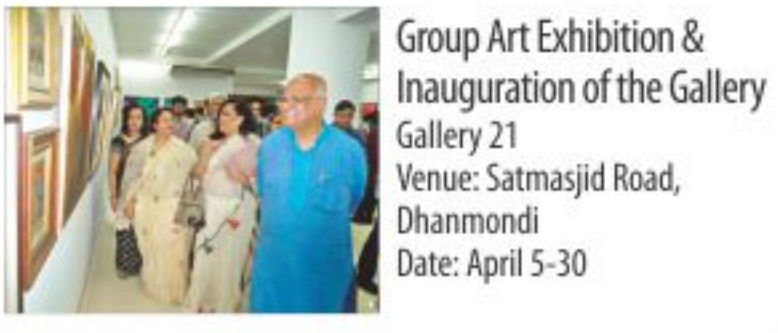
Group Art Exhibition & Inauguration of the Gallery Gallery 21 Venue: Satsmaji Road, Dhanmondi Date: April 5-30