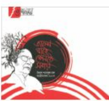
Syed Shamsul Haq Matya Utsab Venue: National Theatre Hall, BSA Date: Apr 19-27 Time: 6pm