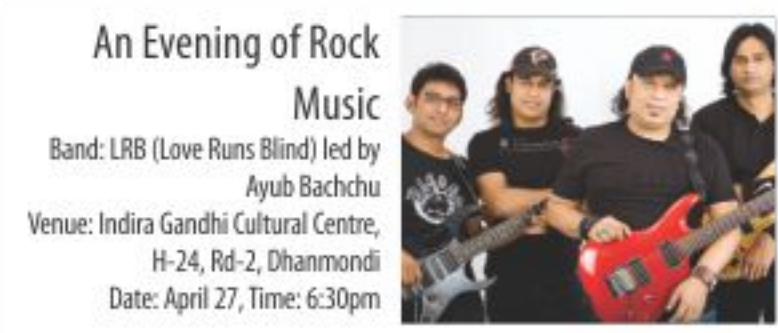
An Evening of Rock Music Band LRB (Live Rock Band) led by Ayub Bachchu Venue: Indira Gandhi Cultural Centre, W 34, Rd 2, Dhanmondi Date: April 22, Time: 6:30pm