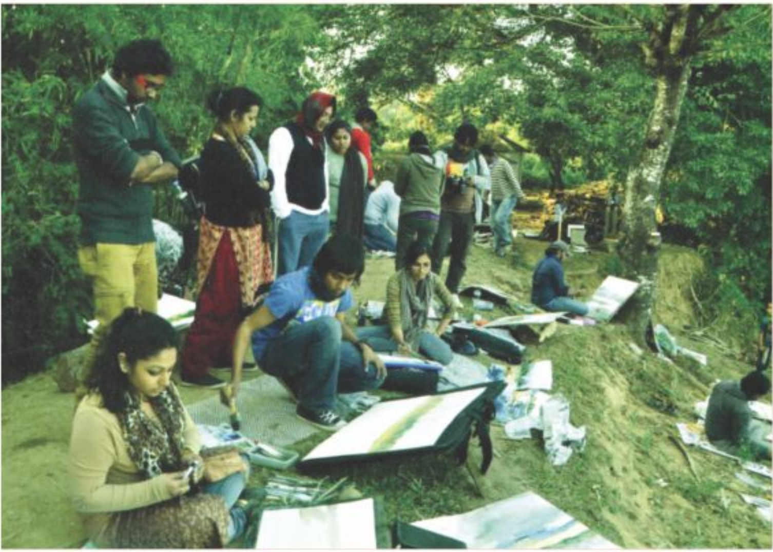
Participating artists at the workshop.

Tania Tripti’s work depicts some vessels in a shallow river. Subdued colours and insight into the subject