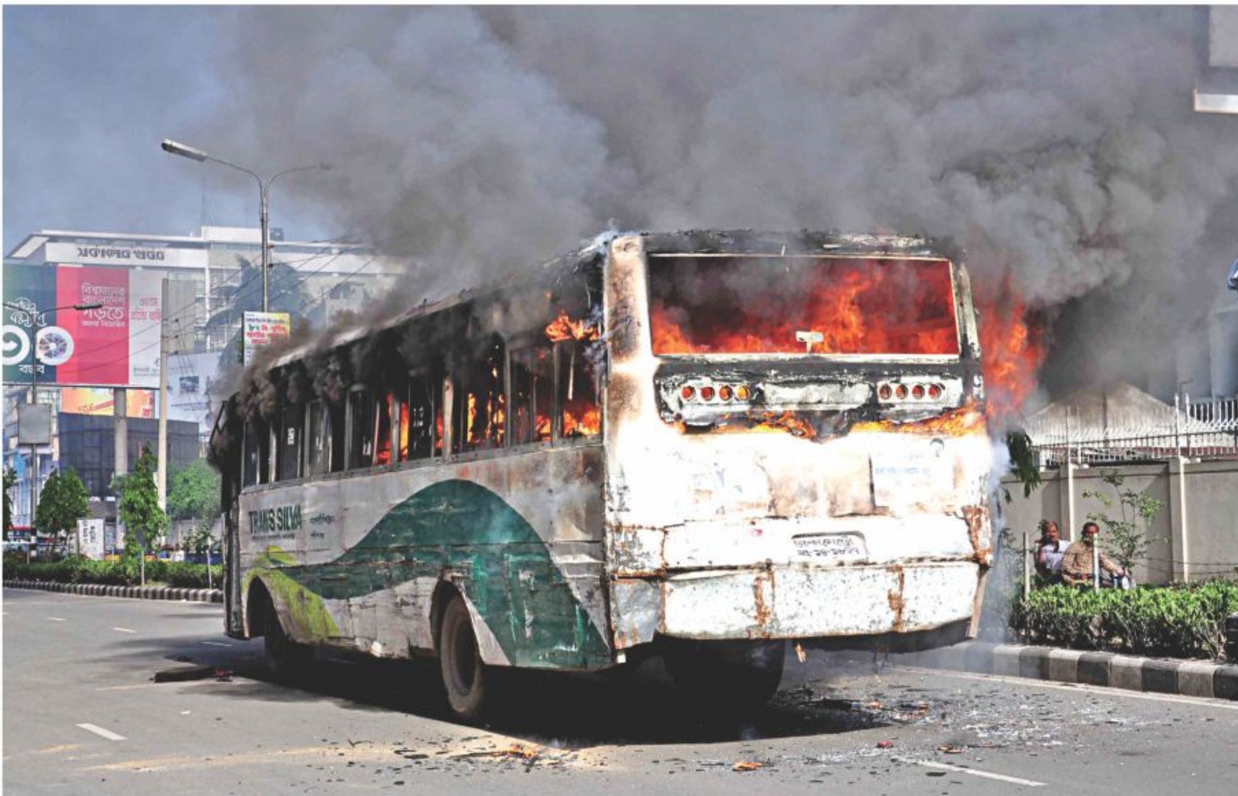
A bus burns on Topkhana Road in the capital yesterday afternoon on the eve of a 36-hour countrywide hartal called by the BNP-led 18-party opposition alliance.