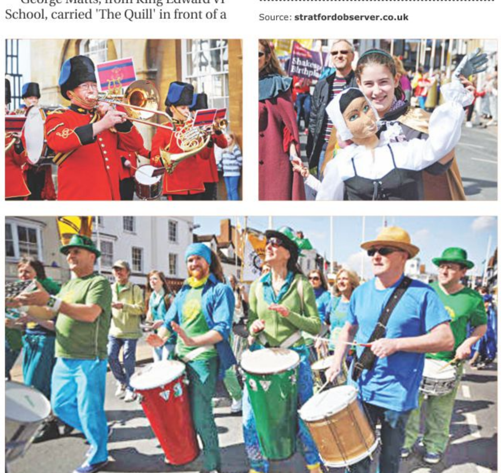
Elizabethan music, sonnet-reciting and a colourful parade; a fitting celebration of Shakespeare's birthday.