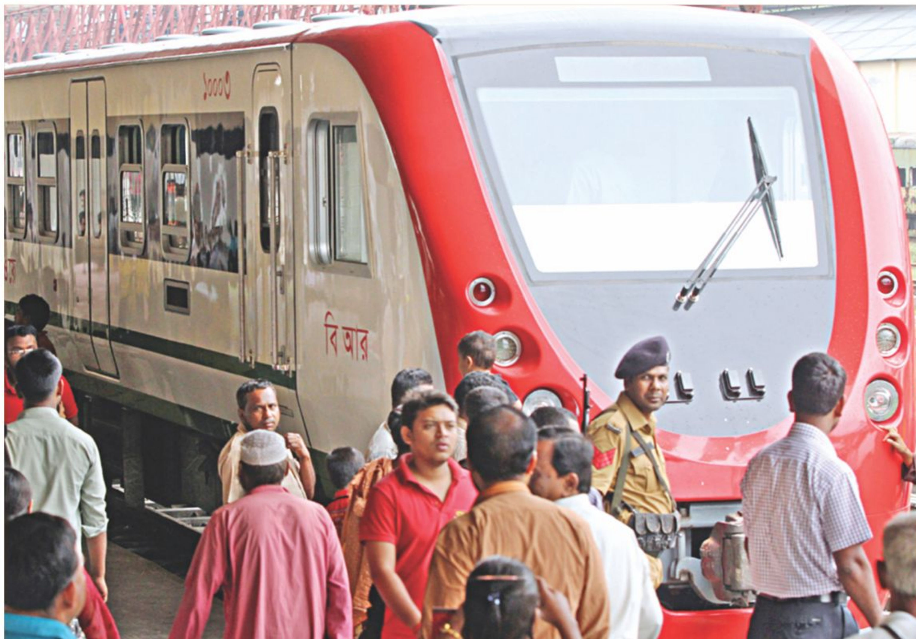
One of two commuter trains, imported from China, arrives at Kamalapur Railway Station in the capital yesterday.

Police had filed the cases with Paltan, Ramna and Shahjahanpur police stations.