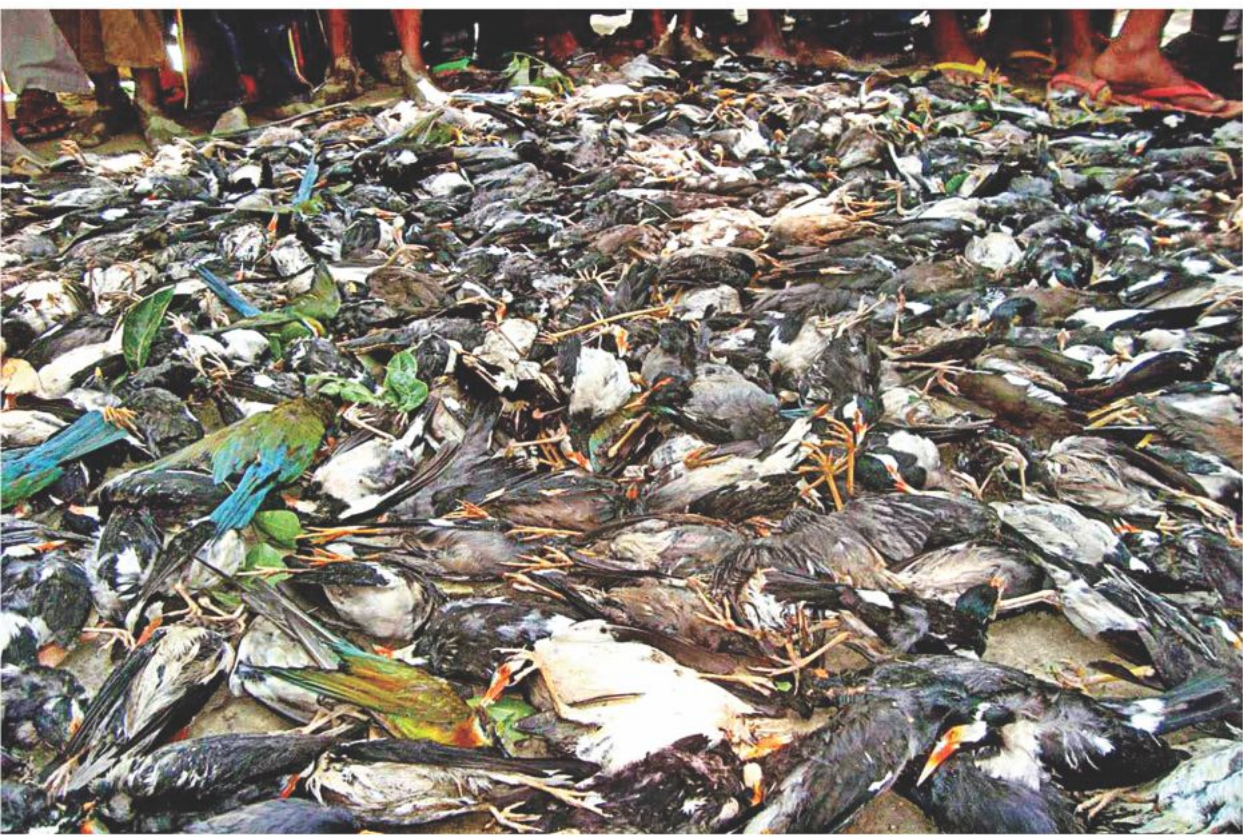
Scores of birds left dead after Friday night's severe storm in Modondanga village of Jhenidah. The photo was taken yesterday morning.