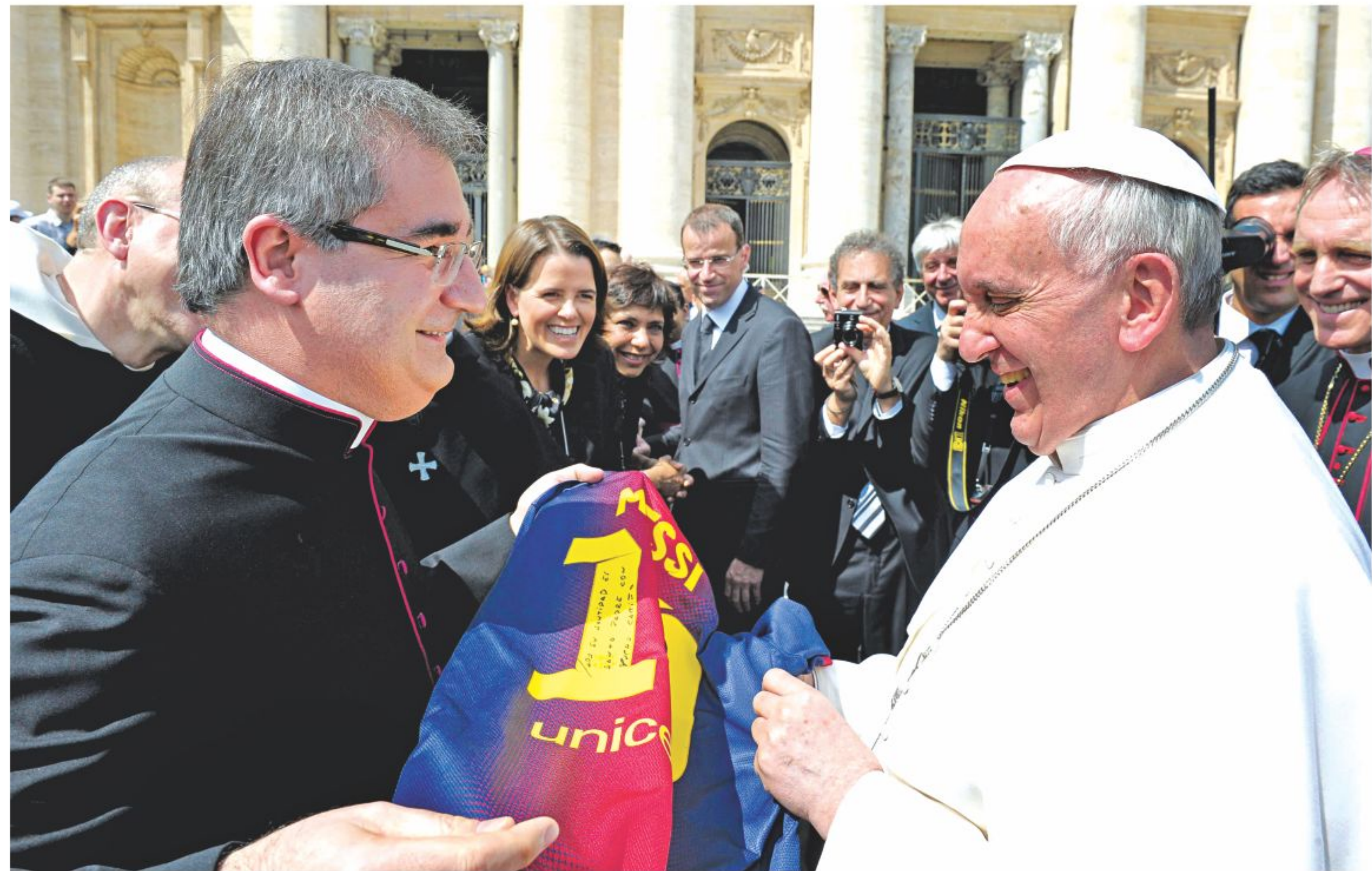
Pope Francis (R) receives a Lionel Messi autographed Barcelona jersey during the weekly audience in Saint Peter's Square at the Vatican on Wednesday.

"We had to get that goal that mattered and, of course, there are so many games where Wayne Rooney is better than other players. But on the night Shinji was playing so well."