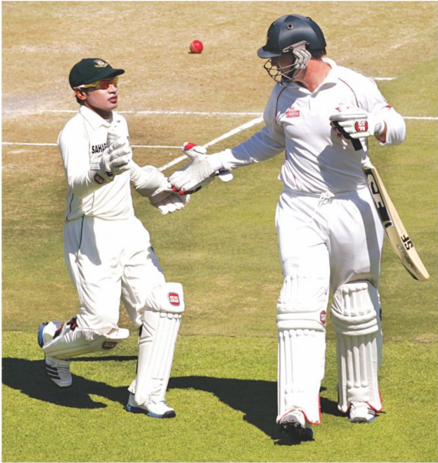
Bangladesh captain Mushfiqur Rahim (L) congratulates his Zimbabwe counterpart Brendan Taylor as the latter leaves field after scoring a superb 171 on the second day of the first Test at Harare yesterday.