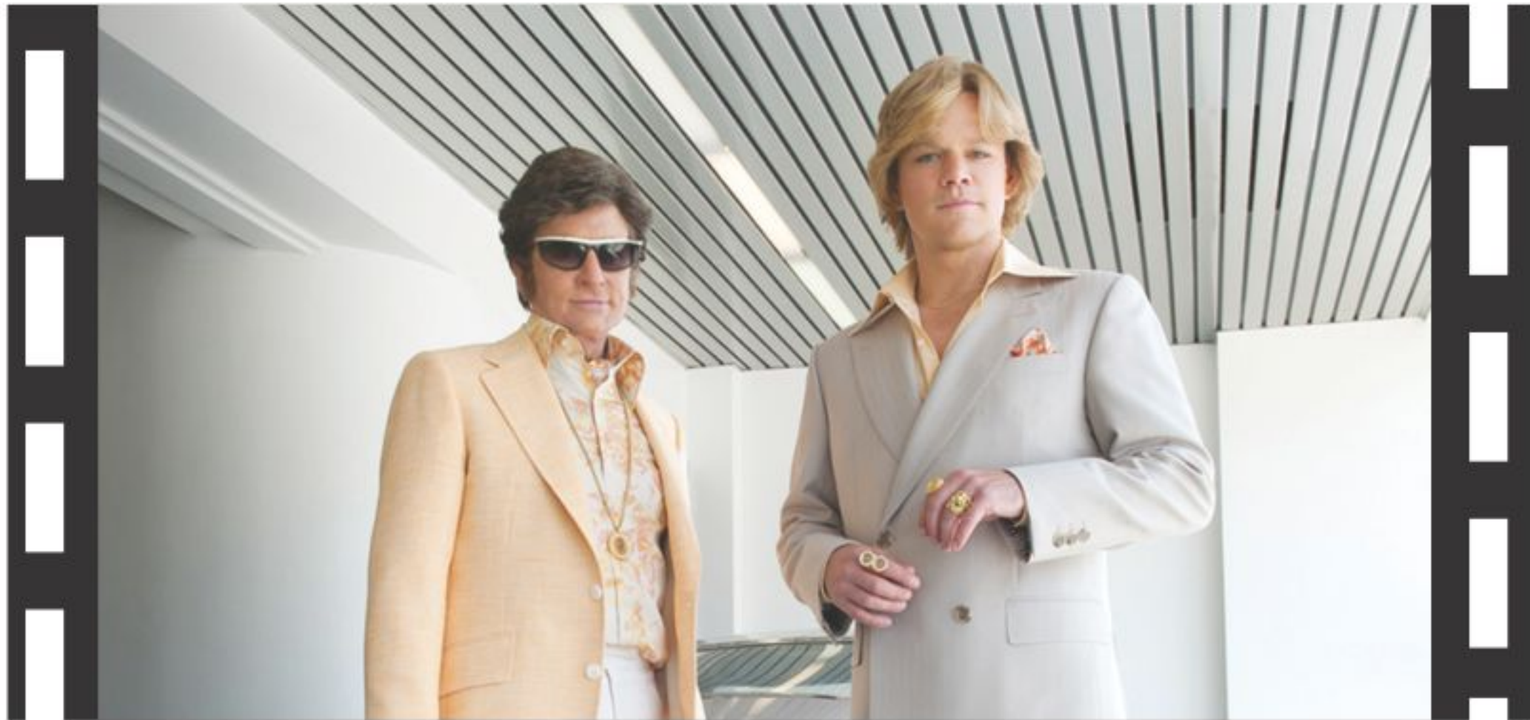
Michael Douglas (L) and Matt Damon pair up for "Behind the Candelabra".

"Only God Forgives", the second film from "Drive" partners Ryan Gosling and Nicolas Winding Refn, joins Steven Soderbergh's Liberace biopic in competition at this year's Cannes Film Festival.