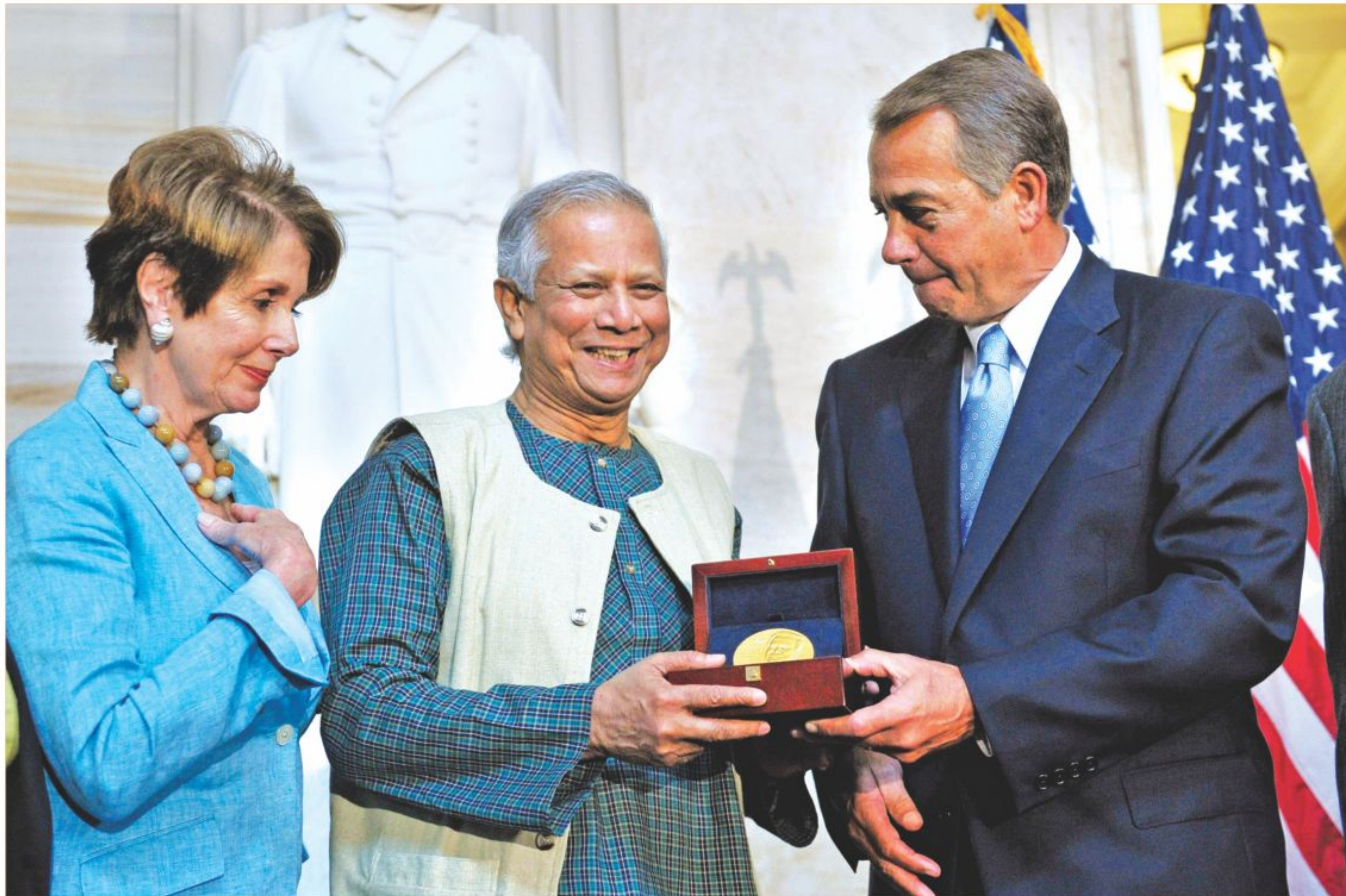
House Speaker John Boehner hands Nobel Laureate Prof Muhammad Yunus the Congressional Gold Medal as House Minority Leader and former speaker Nancy Pelosi watches during a ceremony yesterday in the Rotunda of the US Capitol in Washington, DC.