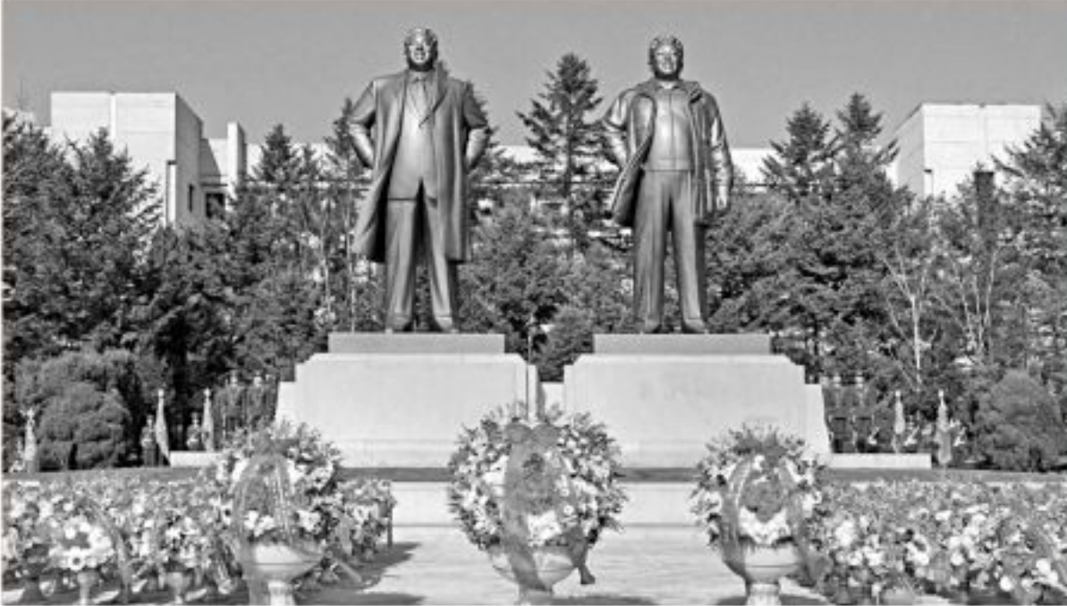
Statues of late North Korean leaders Kim Il-Sung (left) and Kim Jong-Il (right) being unveiled in Pyongyang ahead of the 101st anniversary of the birth of Kim Il-Sung on Sunday.

Nevertheless, US Secretary of State John Kerry, ending a trip to the region dominated by concern about North Korea, stressed his interest in a diplomatic solution.