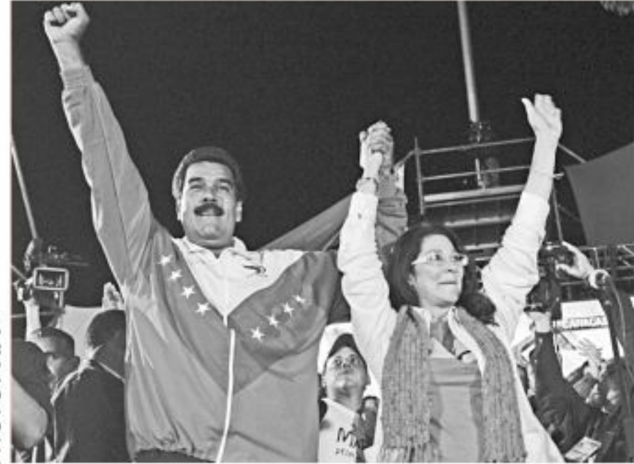
Nicolas Maduro celebrates with his wife Cilia Flores after knowing the results.