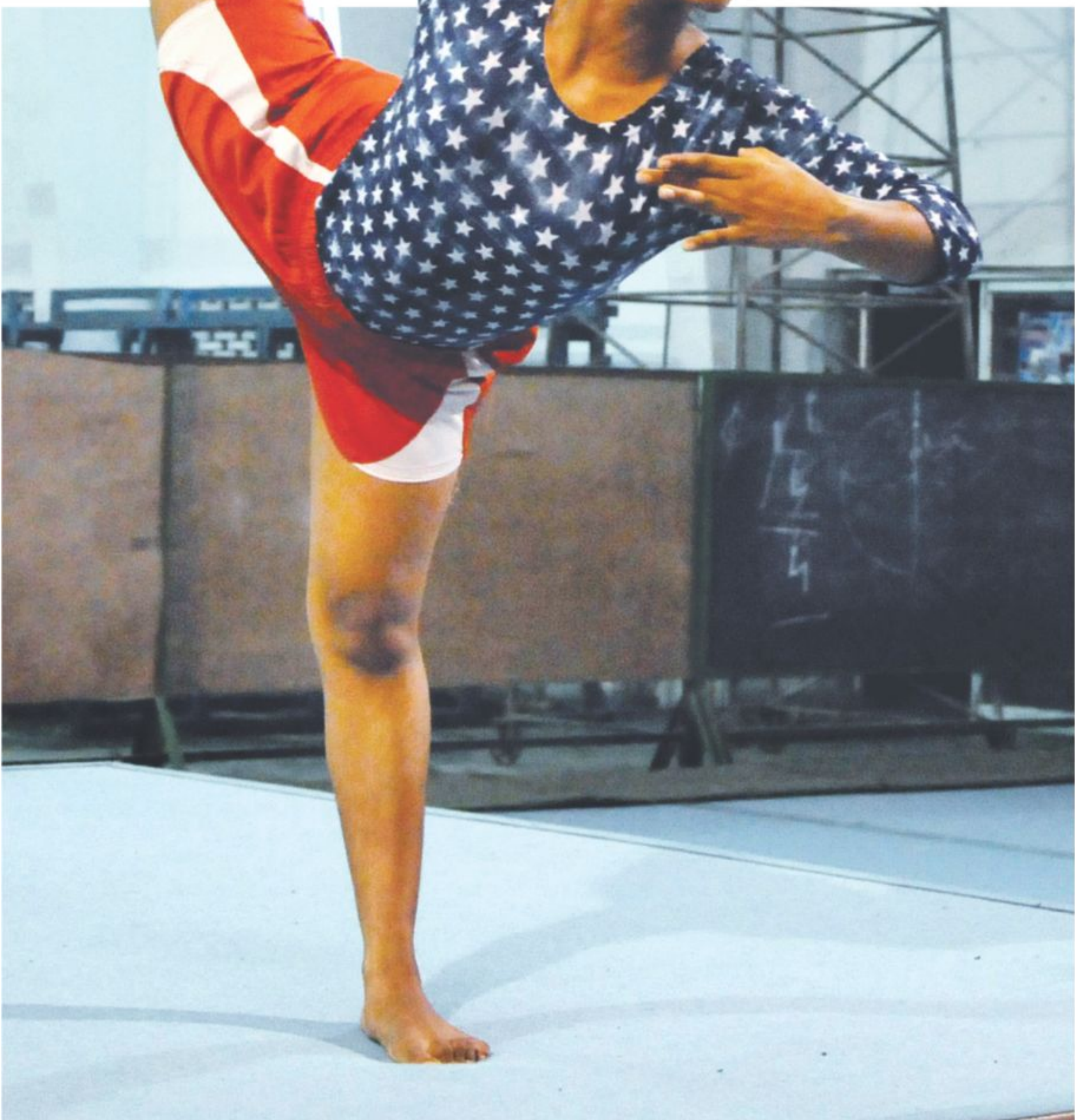
A gymnast performs on the floor of the National Sports Council gymnasium yesterday, as part of preparation for the 8th Bangladesh Games which is scheduled to begin on April 20.