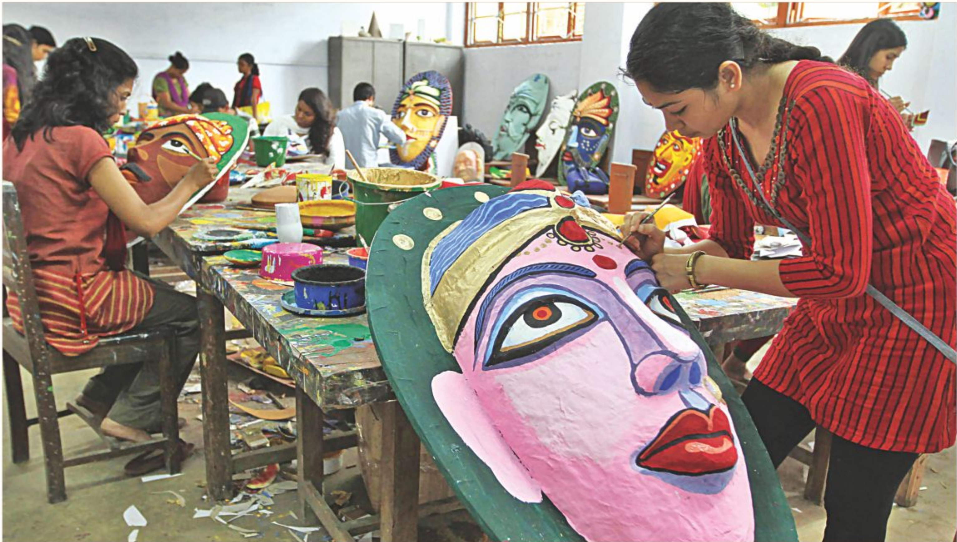
Students of Institute of Fine Arts, Dhaka University, are giving final touches to their creations as the nation prepares for the celebration of Pahela Baishakh, the first day of Bangla calendar, on April 14.