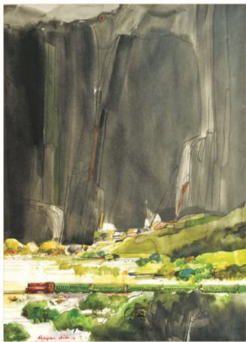
Artworks by Rafiqun Nabi.

"I have been working on a number of certain themes. I had an opportunity to observe rural people and their way of life, and I found it incredibly interesting. I have always been fascinated by this simple, uncomplicated life. I think villagers appreciate and enjoy the gifts of nature -- greenery, rivers, hills, light and shade, flora and fauna -- more