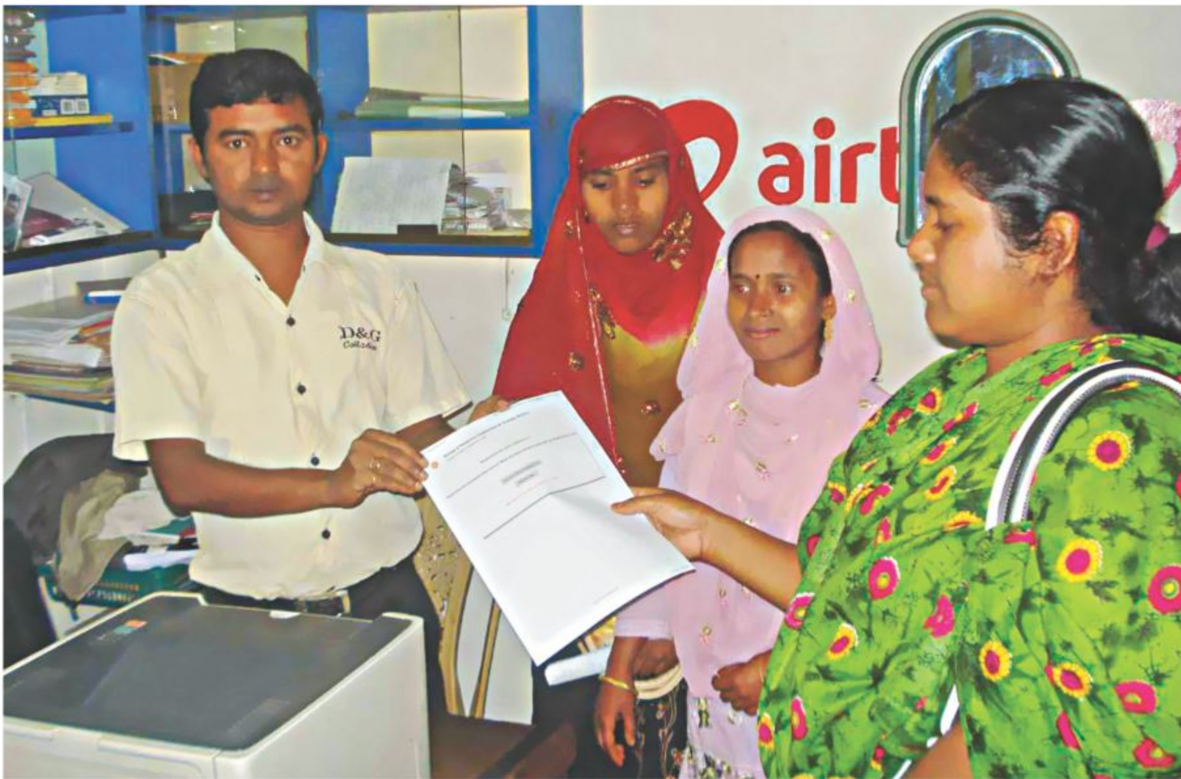
The online registration of women seeking overseas employment through the government begins in Rangpur yesterday.