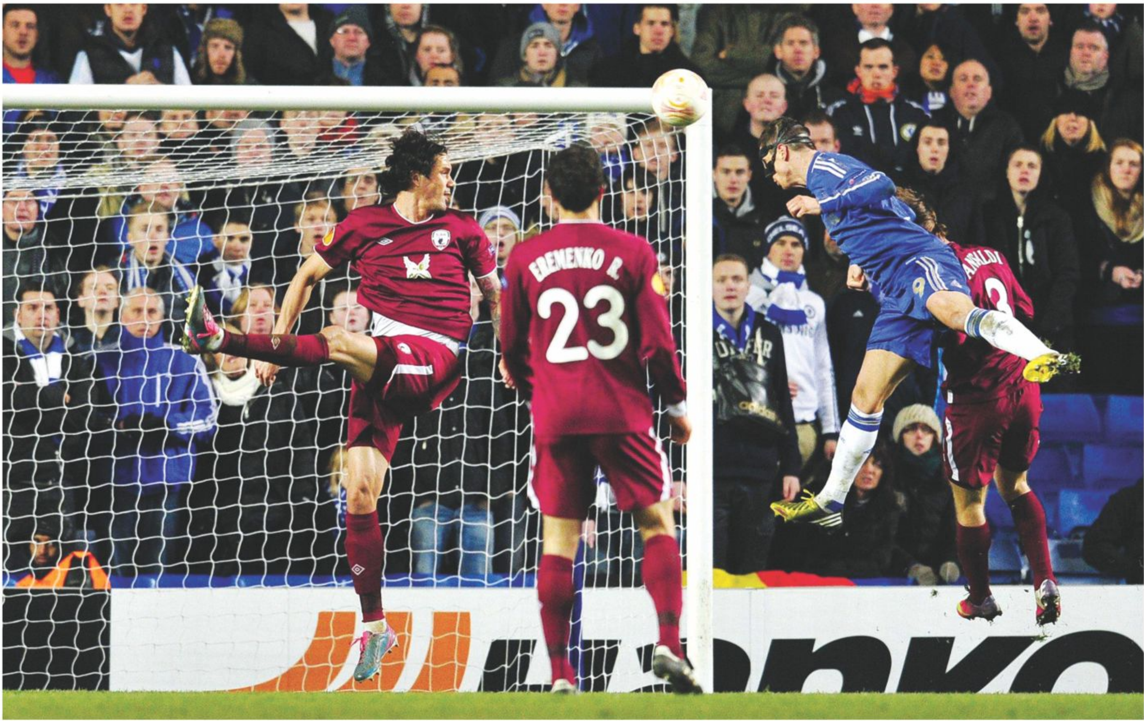
Chelsea striker Fernando Torres heads in the third goal during their Europa League quarterfinal first leg against Rubin Kazan at Stamford Bridge on Thursday.