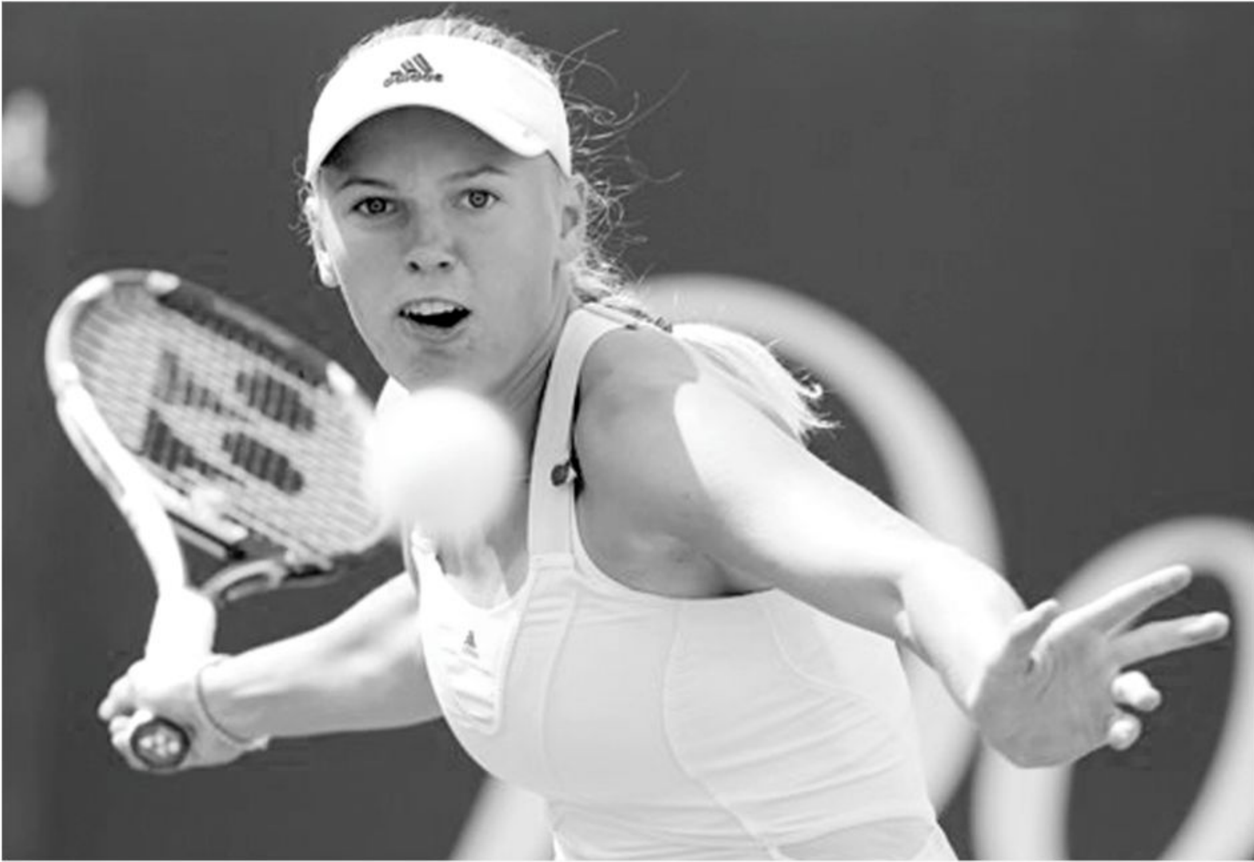
Caroline Wozniacki of Denmark makes a forehand return to Silvia Soler-Espinosa of Spain during their Family Circle Cup encounter in Charleston on Wednesday.