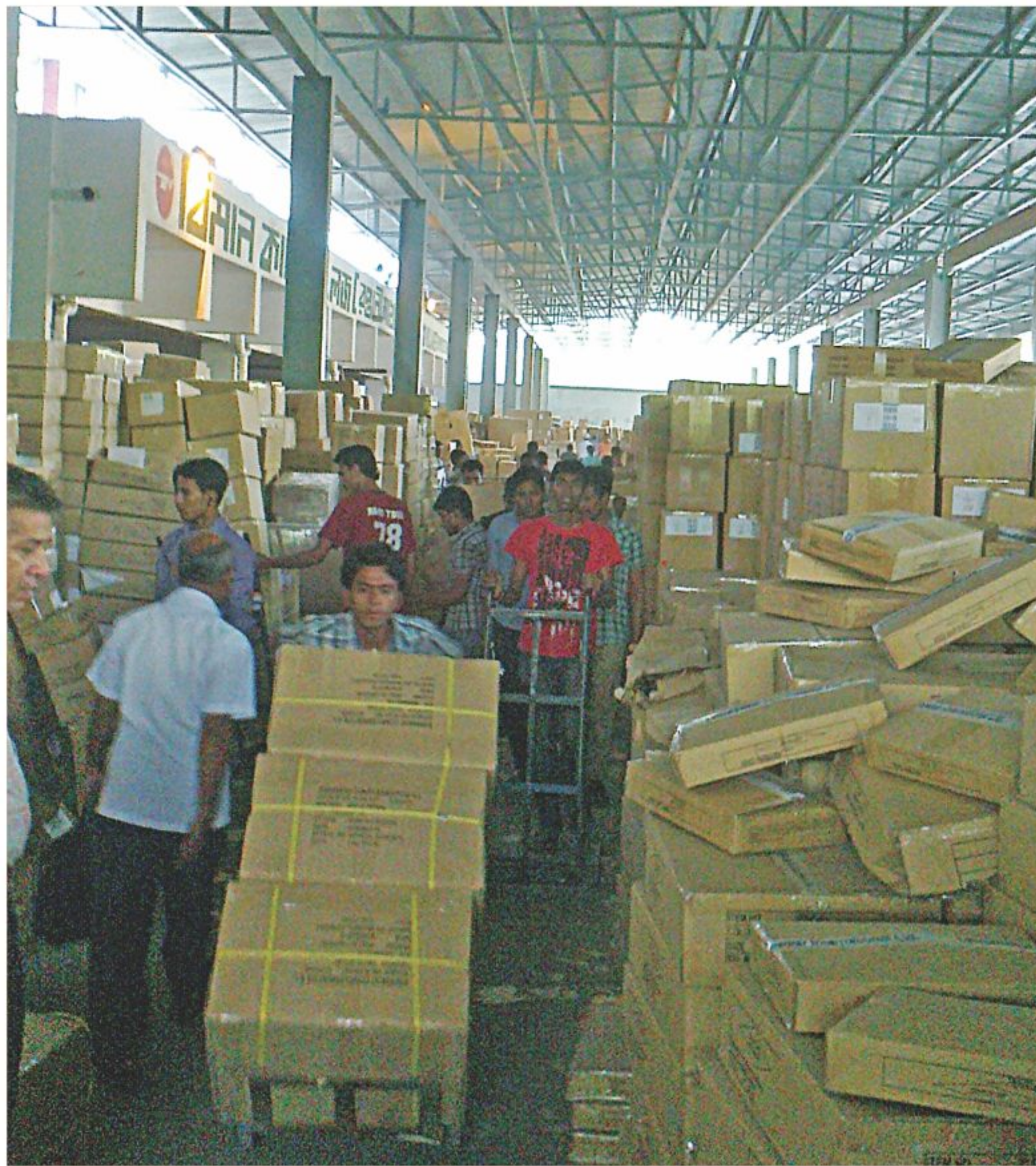
Boxes filled with clothes pile up at Shahjalal International Airport as the export-oriented garment industries opt for air to ship their cargoes instead of the usual shipment via sea. Frequent hartals have forced many factories to switch to expensive air freight.