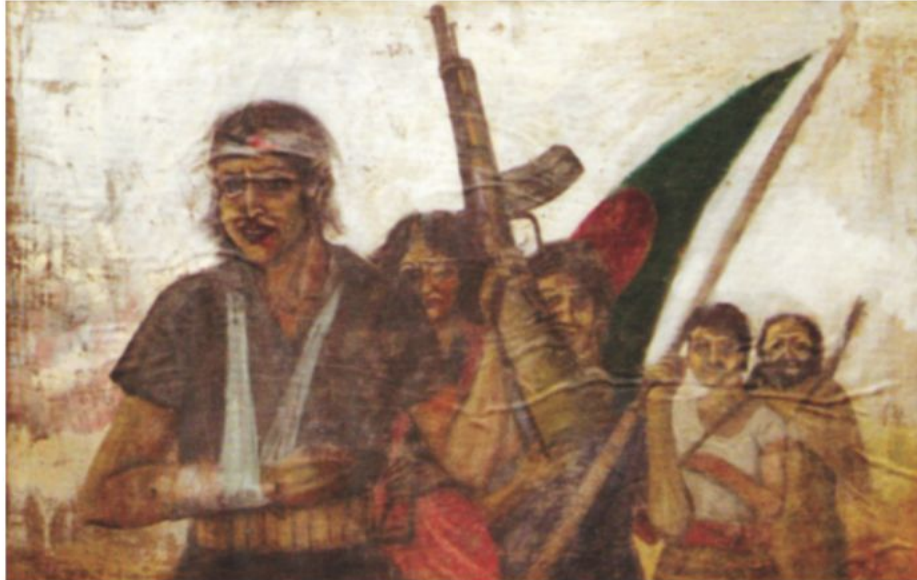
Clockwise (from top): Artworks by Zainul Abedin, Aminul Islam and Qamrul Hassan.