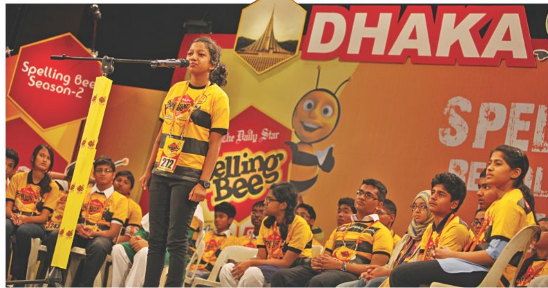
A participant takes on the spelling challenge.