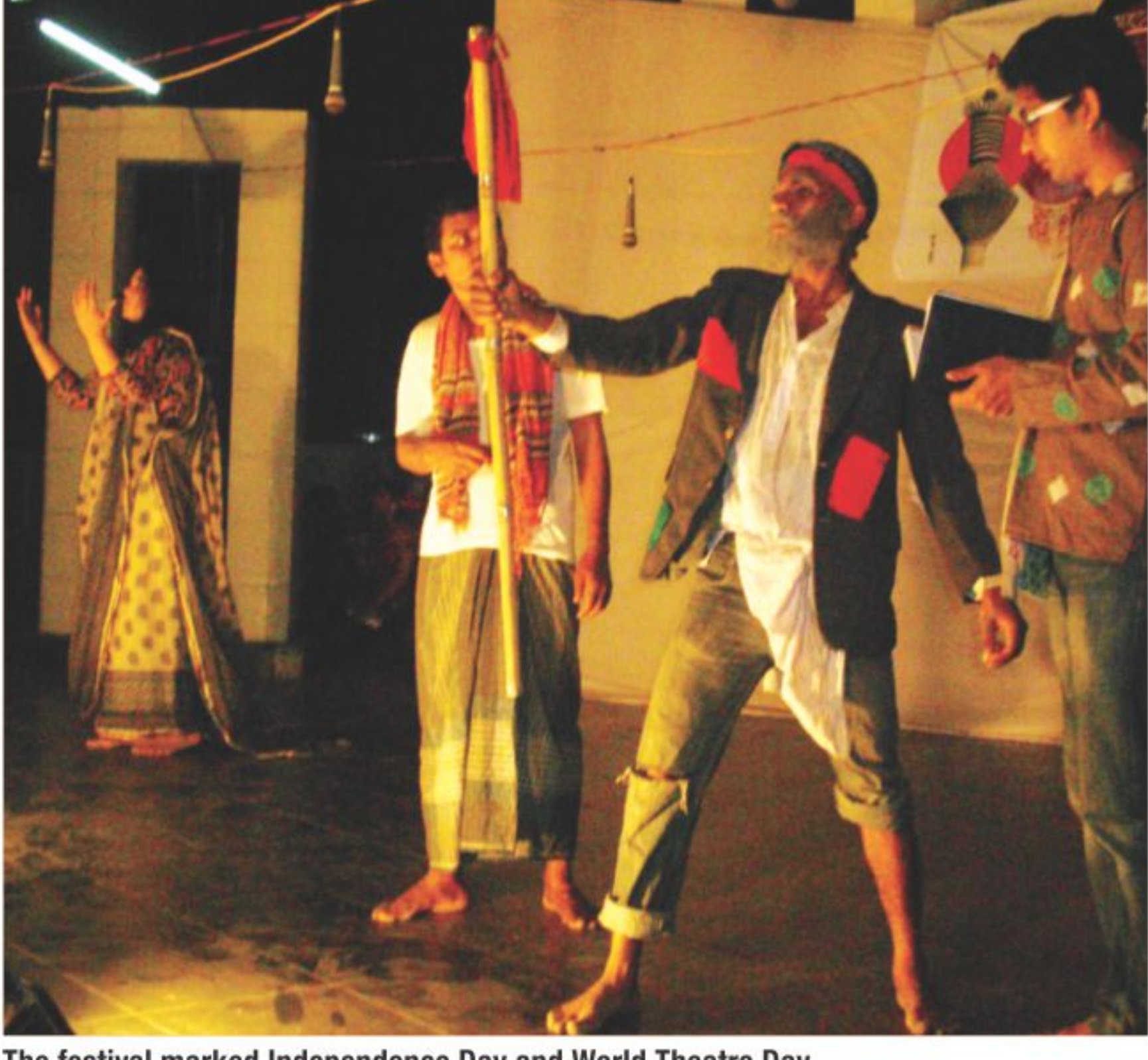
The festival marked Independence Day and World Theatre Day.