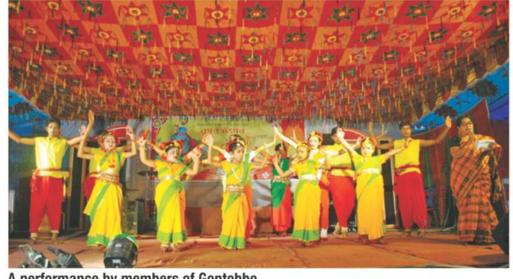
A performance by members of Gontobbo.