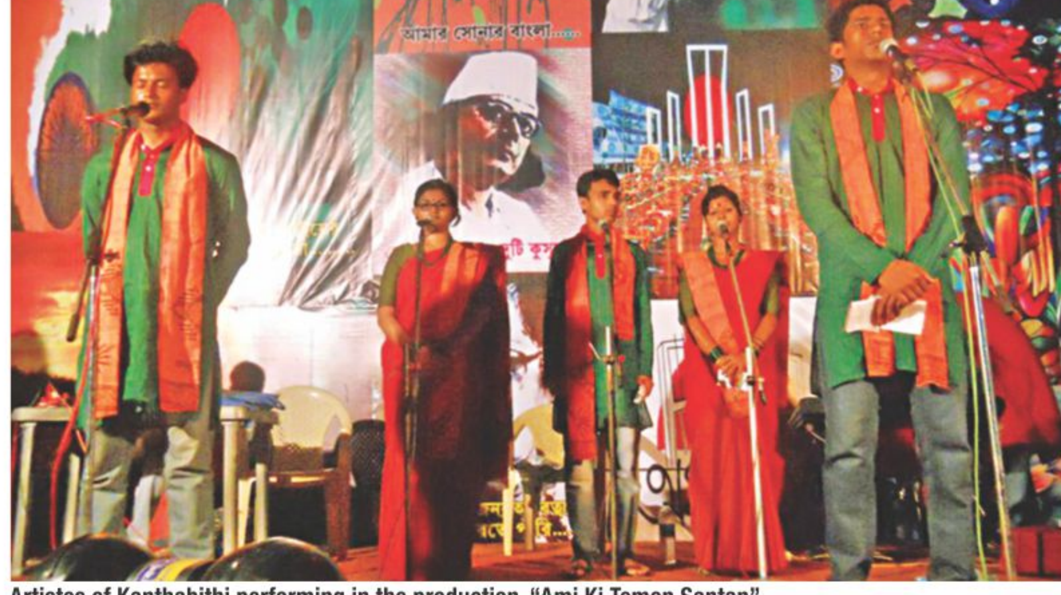
Artistes of Kanthabithi performing in the production, "Ami Ki Temon Santan".