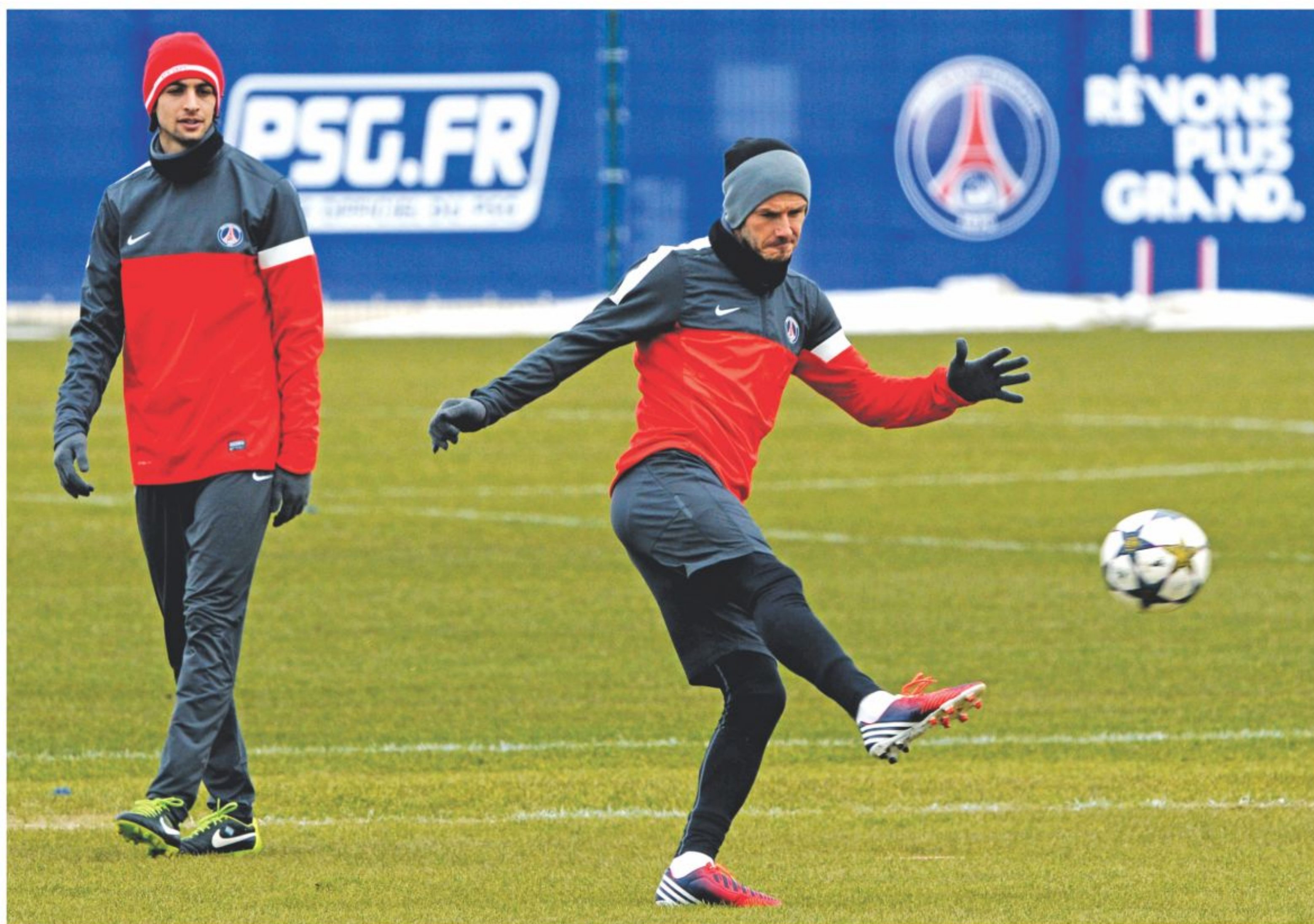
Paris Saint-Germain midfielder David Beckham (R) kicks the ball as teammate Javier Pastore looks on during a training session at the Parc des Princes Stadium yesterday.

The four-time European champions are well on their way to a 22nd Spanish title as they hold a commanding 11 point lead on Atletico Madrid but have gone off the boil in recent weeks with defeats against Real Madrid in both the Spanish Cup and league as well as the reverse at the San Siro.