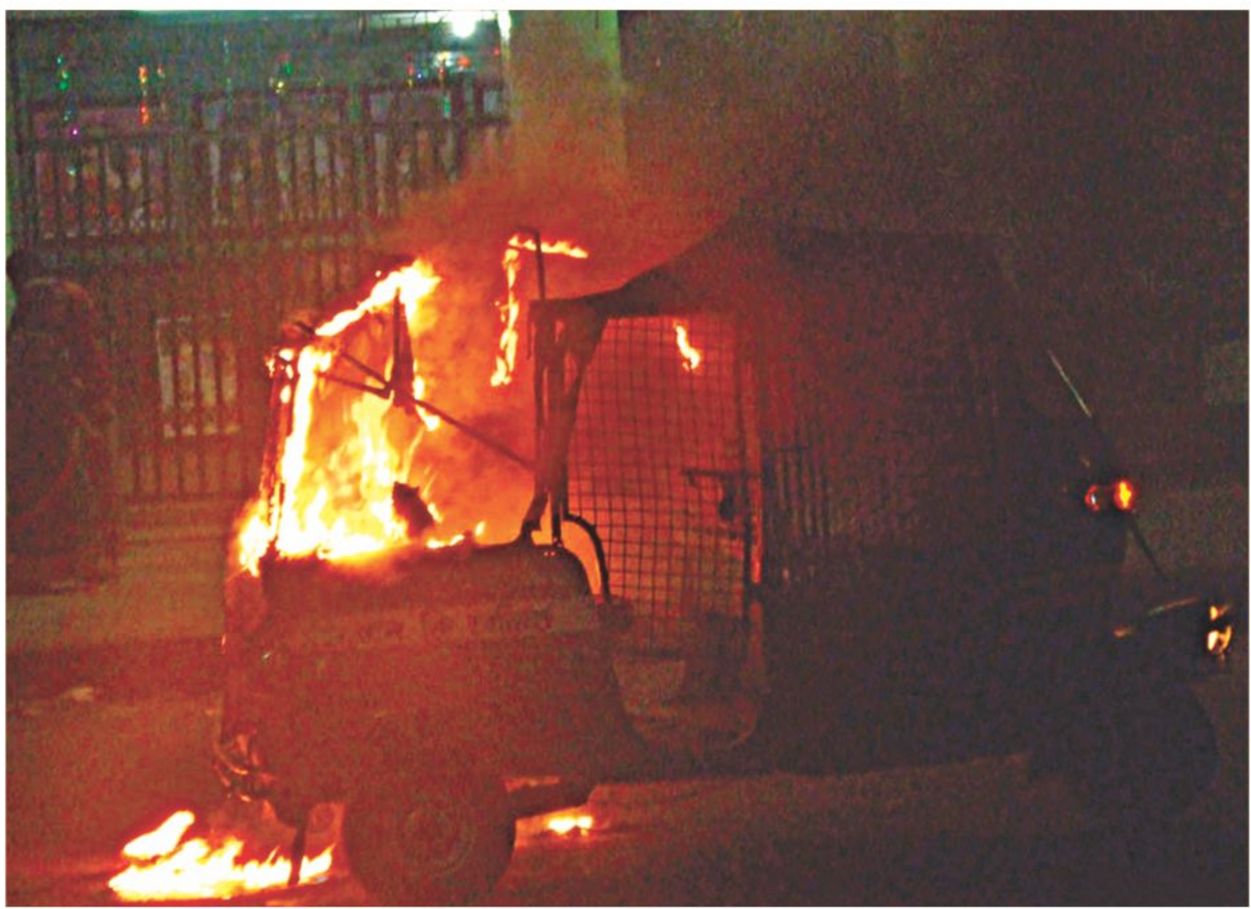
A CNG-run auto-rickshaw burns before Jonaki Cinema Hall in the capital after hartal supporters set it on fire last night.

In a separate incident, a schoolteacher and her seven-year-old daughter were injured in a cracker blast at the house of a Jubo League activist at Botertol village in Companiganj upazila early yesterday.