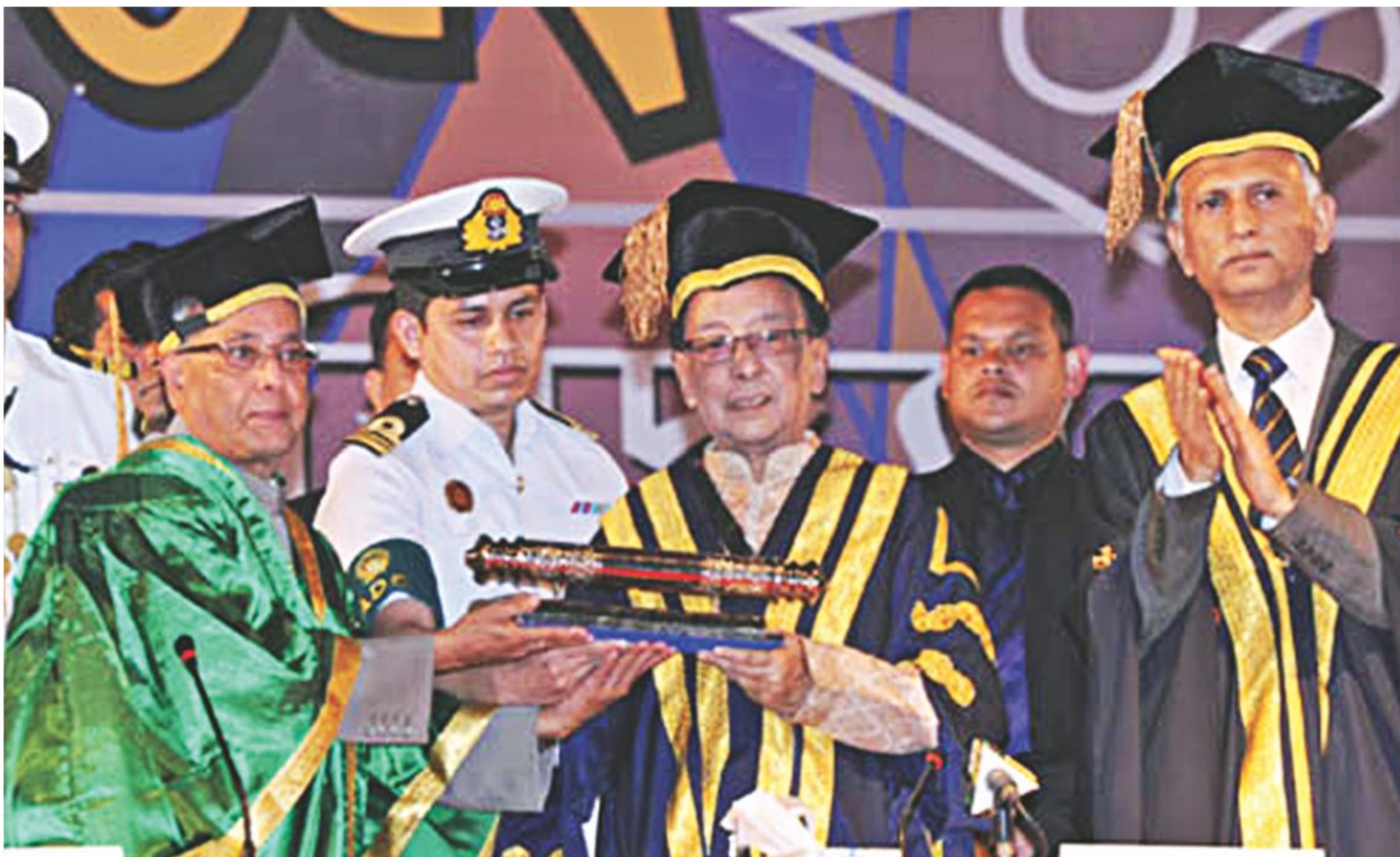
President Zillur Rahman confers honorary Doctorate of Law on Indian President Pranab Mukherjee at the 47th convocation of Dhaka University yesterday.