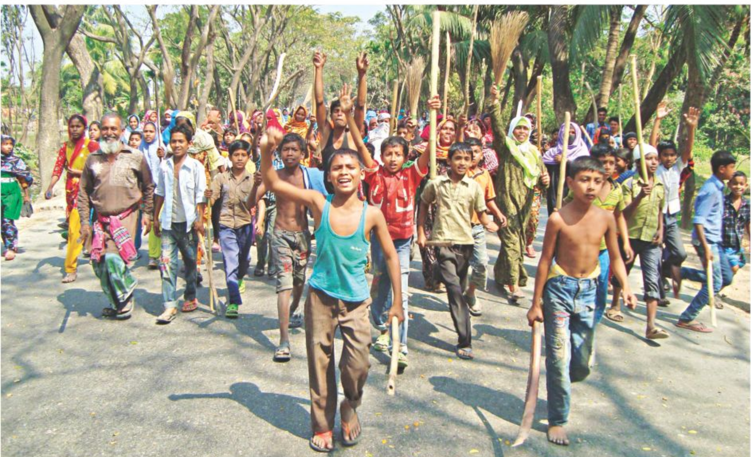
Jamaat-e-Islami engages women and children in blocking a road in Jhenidah during the hartal yesterday. The party used them as human shields during clashes with law enforcers at different parts of the country, resulting in the death of three women in Bogra and a boy in Rajshahi.