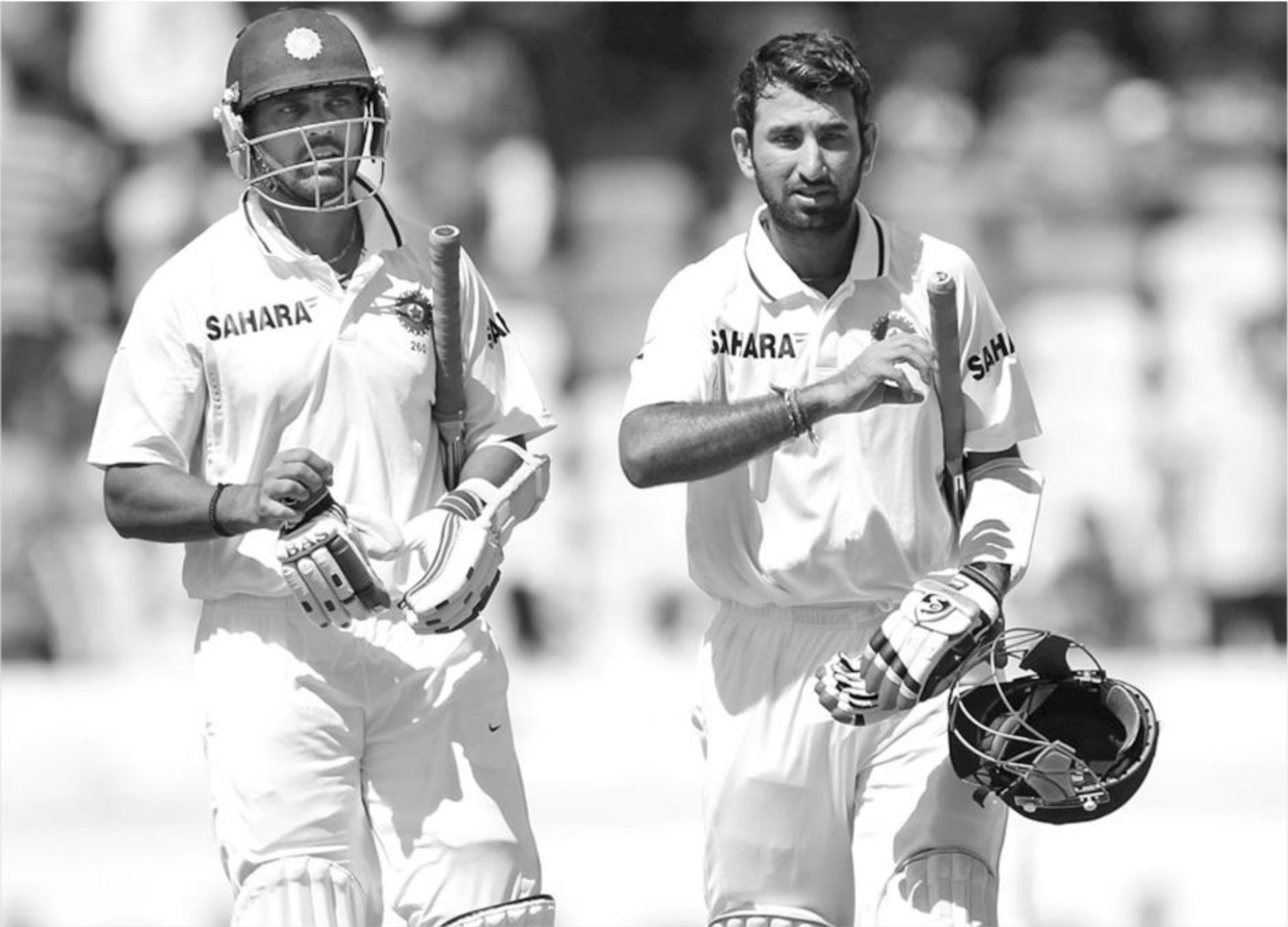
Centurions Murali Vijay and Cheteshwar Pujara leave the field at the tea break on the second day of the second Test against Australia in Hyderabad yesterday.