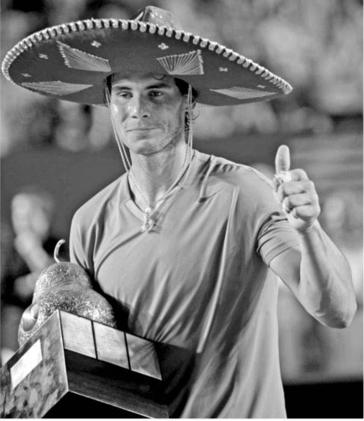
Rafael Nadal, wearing a sombrero, gestures to the crowd after winning the Mexico ATP Open in Acapulco on Saturday.

"I have had some difficult months, especially during my time away from tennis. But I take with me fond memories of returning to Acapulco," said Nadal.