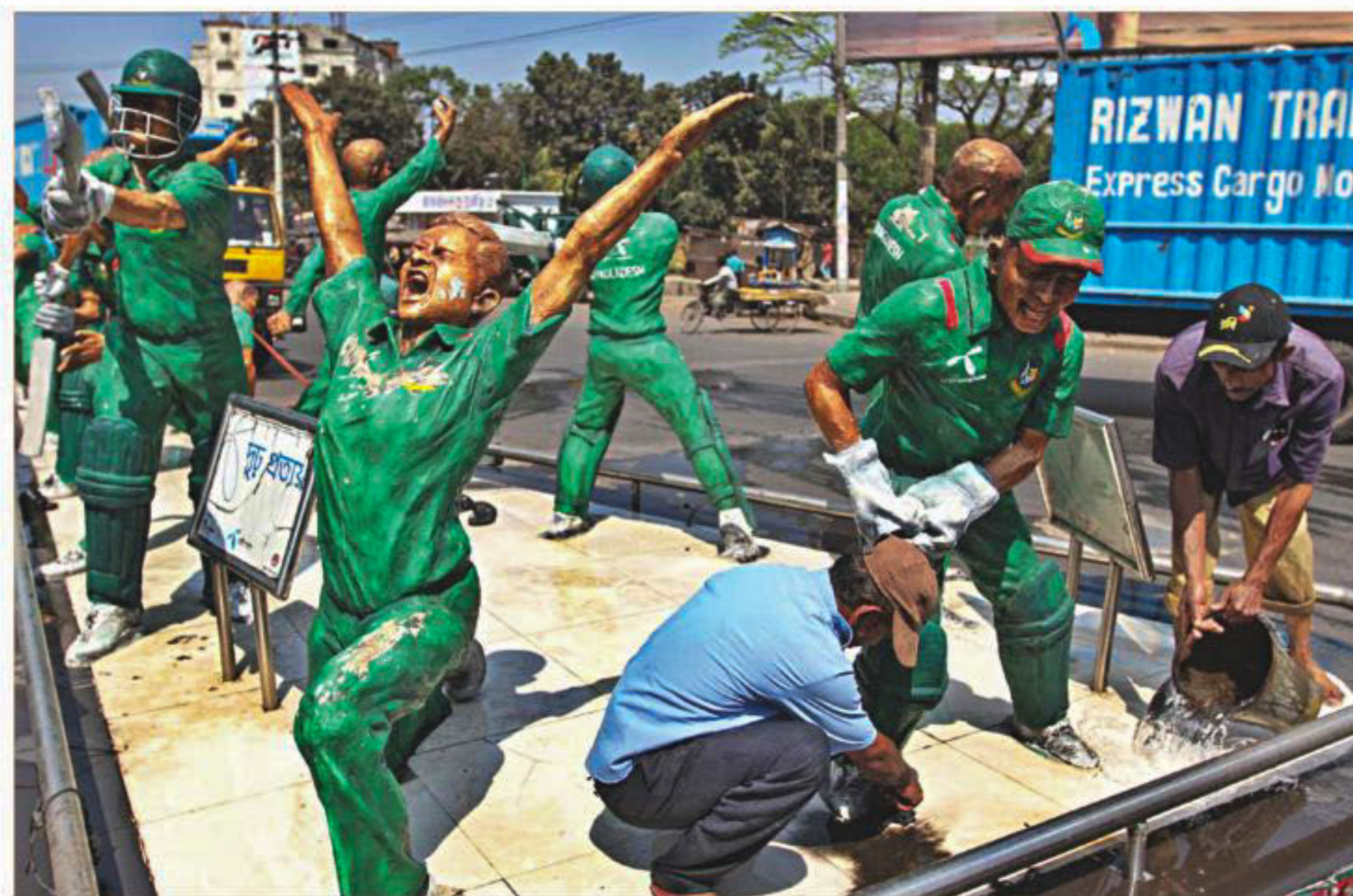
Chittagong City Corporation yesterday took the initiative to wash these sculptures of Bangladesh players, installed in Nimtol ahead of 2011 ICC Cricket World Cup for beautification of the port city, following publication of a photo in The Daily Star on February 27 showing them all discoloured and covered with dirt due to negligence.

Injured Bappi and Shohag were admitted to Kaliganj Upazila Health Complex.