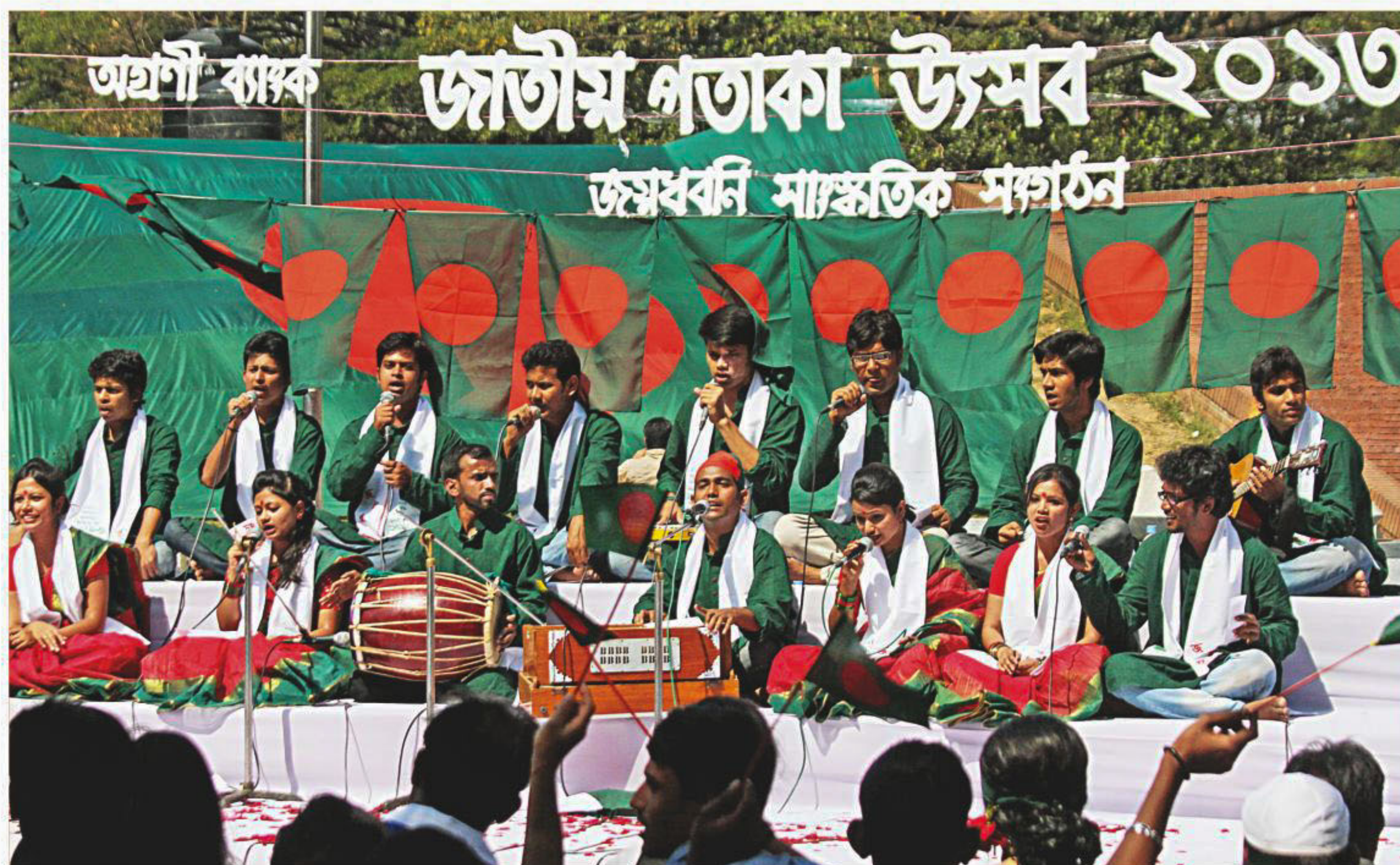
Artists of Joyoddhoni Sangskritik Sangathan render songs during the "National Flag Festival 2013" it organised at Suhrawardy Udyan in the capital yesterday.