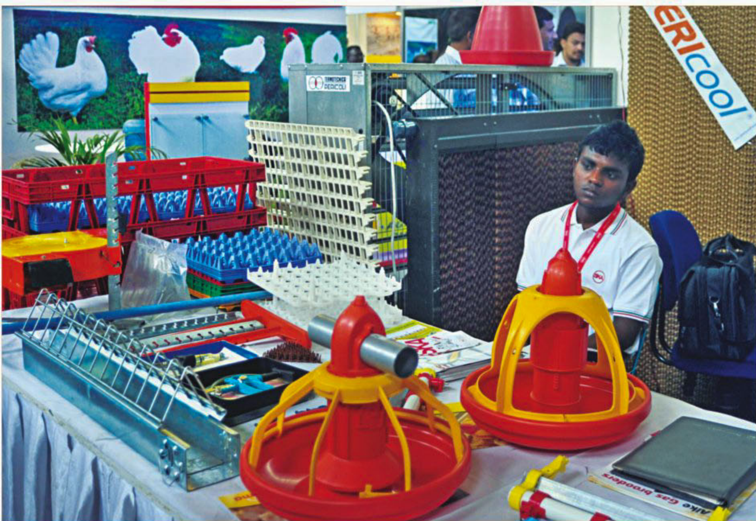
Various equipment and tools are on display at a stall at the international poultry fair in Dhaka yesterday.