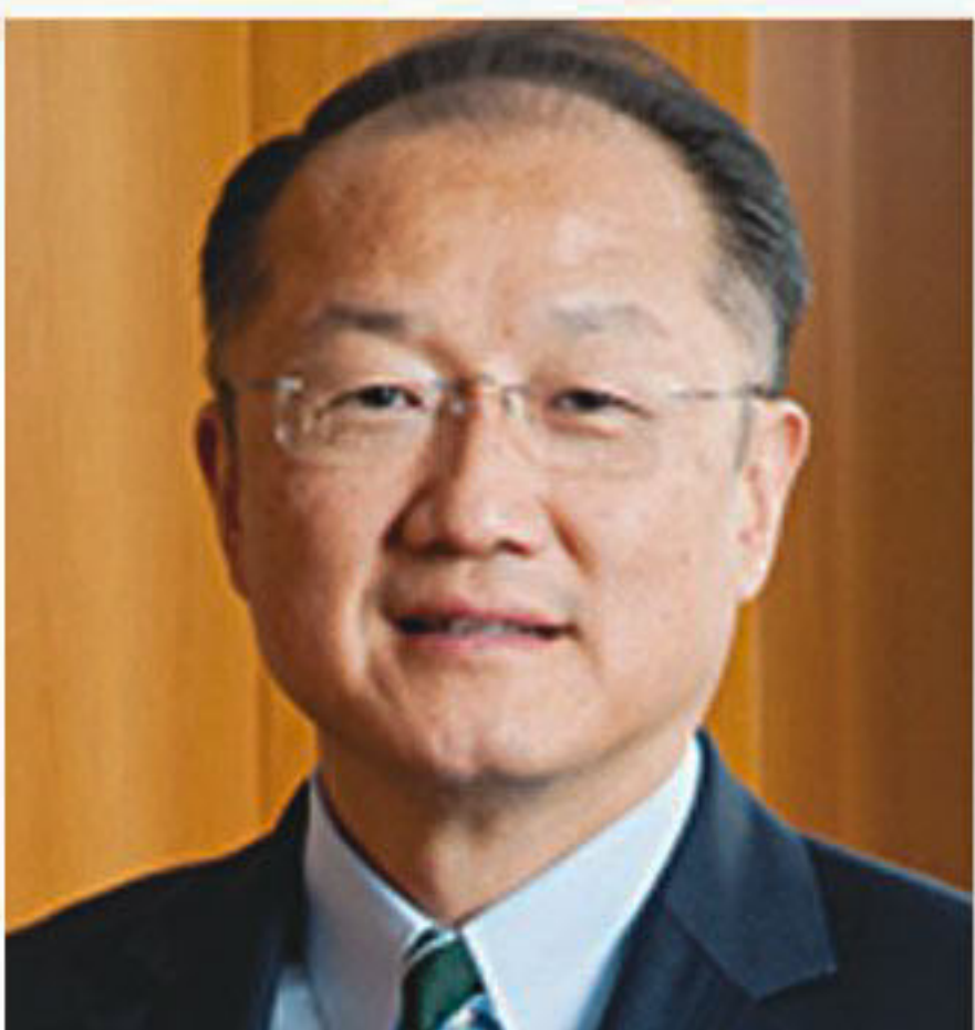
Jim Yong Kim

social transformation" with an influx of girls into the education system and women into the labour force. Economic growth has pulled 16 million people out of poverty in the last 10 years, but the development needs still remain "large and pressing" with around 47 million people still living in poverty, the WB said. The WB president also raised the Grameen Bank issue at the meeting, in response to which Muhith presented the government's position on it, said officials present at the meeting. Muhith flew out to Washington on February 24 to "improve the relations with one of the largest development partners of the country", which has been strained due to the Padma bridge project. Following allegations of corruption in June last year, the WB cancelled the $1.2 billion financing for the Padma Bridge. Upon request from the Bangladesh government, the global lender reengaged with the project, only for the government to withdraw on January 31 due to its inability to meet WB's conditions. Since 1972, the WB has provided around $16 billion for: strengthening the social safety net, enhancing the health and education systems, adaptation to climate change, infrastructure modernisation, empowerment of local governments, promotion of reforms to stimulate broad-based growth and agriculture development. At present, the WB is financing 41 projects in Bangladesh worth $4.23 billion.