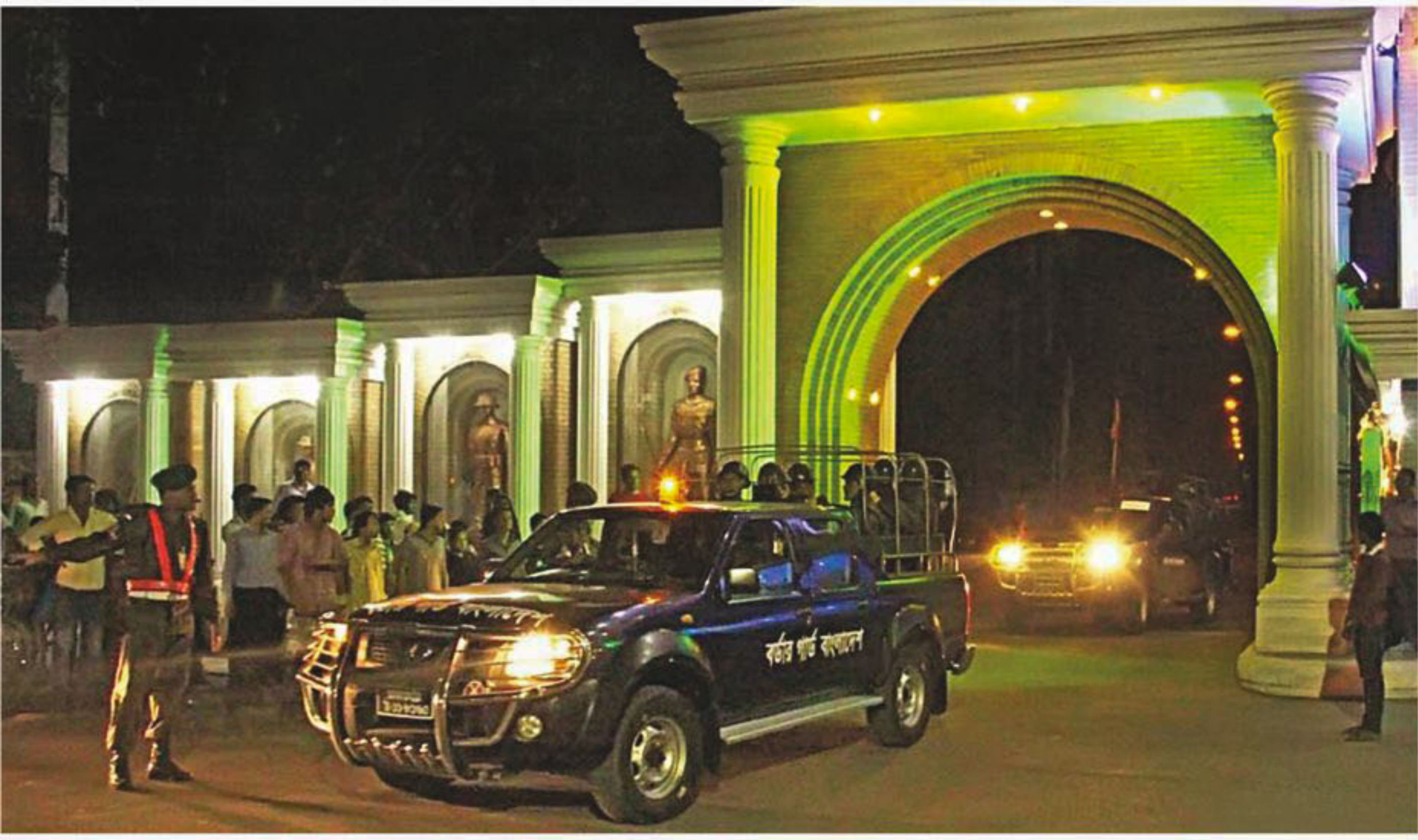
In convoy, Border Guard Bangladesh personnel get out of their Pilkhana headquarters in the capital last night as they have been deployed to help maintain law and order ahead of the verdict delivery in the war crimes case against Jamaat leader Sayedee.

In her scripted answer, the premier said her government has already purchased missile, torpedo for destroying ship and submarine, depth charge, rocket launcher, canon, radar and other weapons for the navy. Earlier on June 13 last year, Planning Minister AK Khandker, who is in charge of the defence ministry in the parliamentary affairs, told parliament that the government has moved to purchase two off-the-shelf [readymade] frigates, two large patrol crafts, two maritime patrol aircrafts and five patrol crafts for the navy. SEE PAGE 12 COL 6