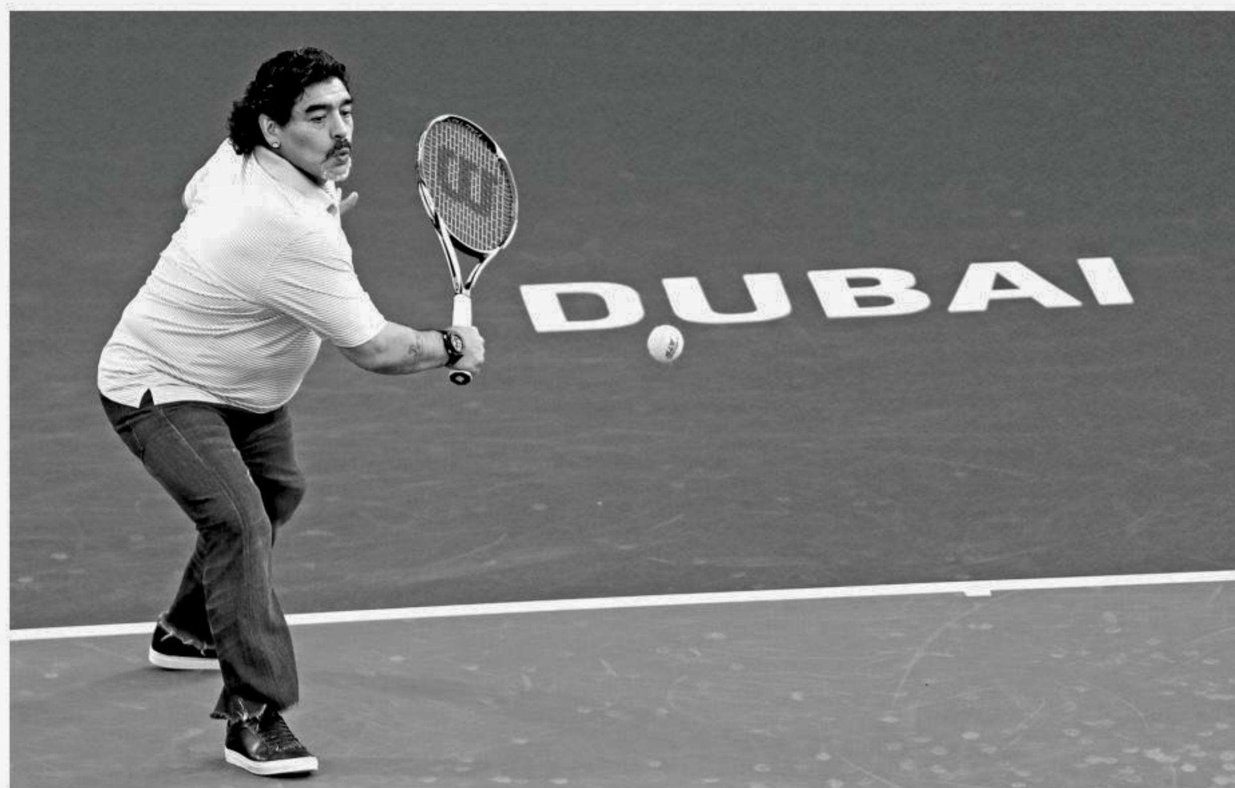
DIFFERENT BALL GAME! Argentine football legend Diego Maradona tries out tennis against his compatriot Juan Martin Del Potro during a show following the latter's victory against India's Somdev Devvarman in the ATP Dubai Open in the Gulf emirate yesterday.

recovered fine," he added. The Bangladesh team will leave for Colombo in the afternoon today to play two Tests, three ODIs and a T20I besides a four-day tour during the month-long tour.