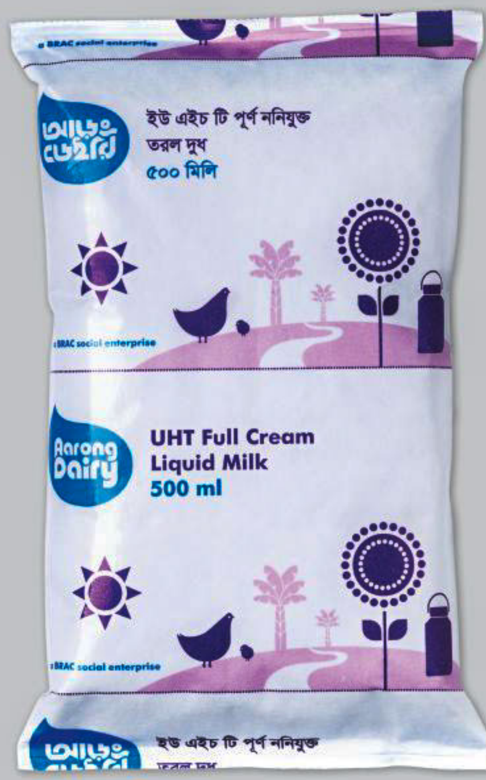
UHT Full Cream Liquid Milk 500 ml pack