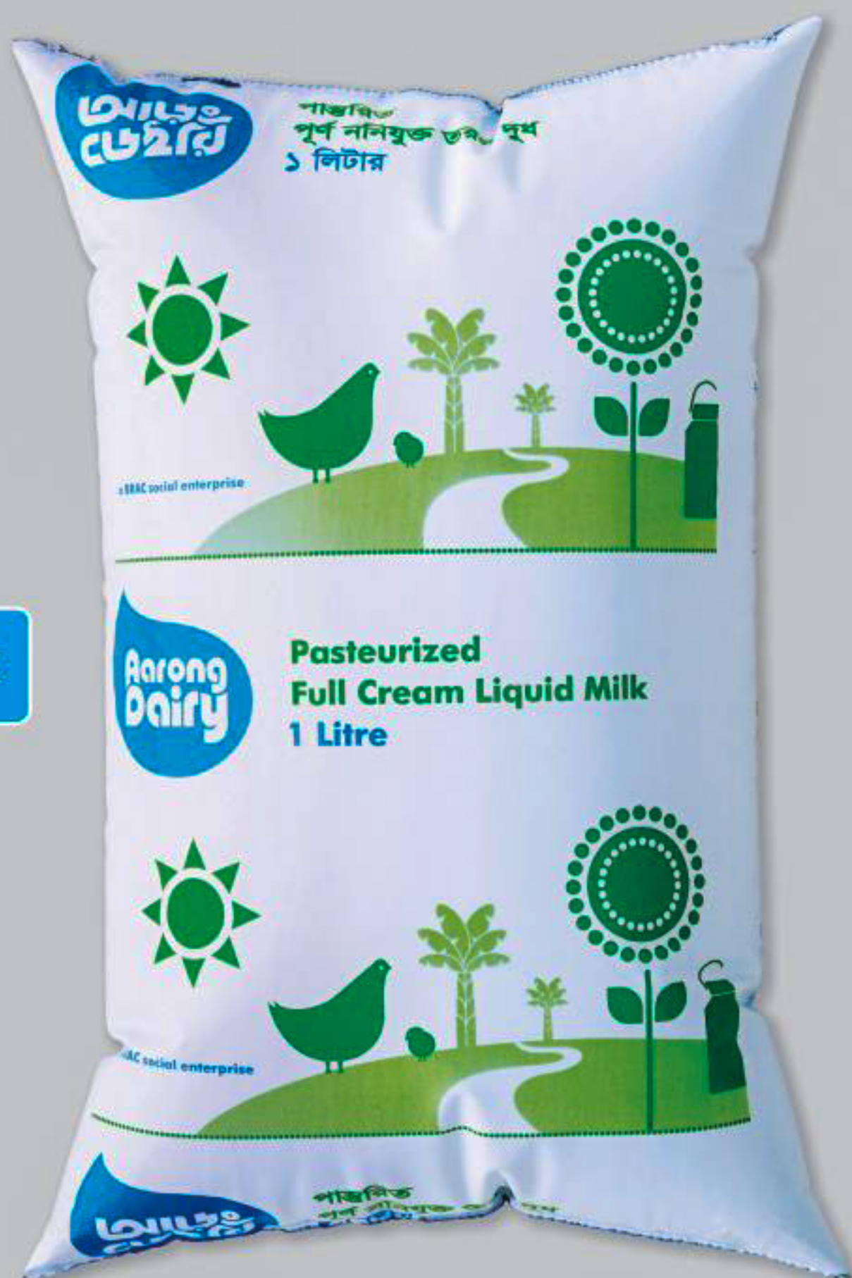
Full Cream Liquid Milk 1 Ltr, 500 ml, 250 ml and 200 ml packs