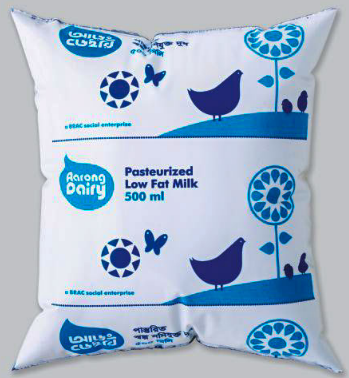
Low Fat Liquid Milk 500 ml pack