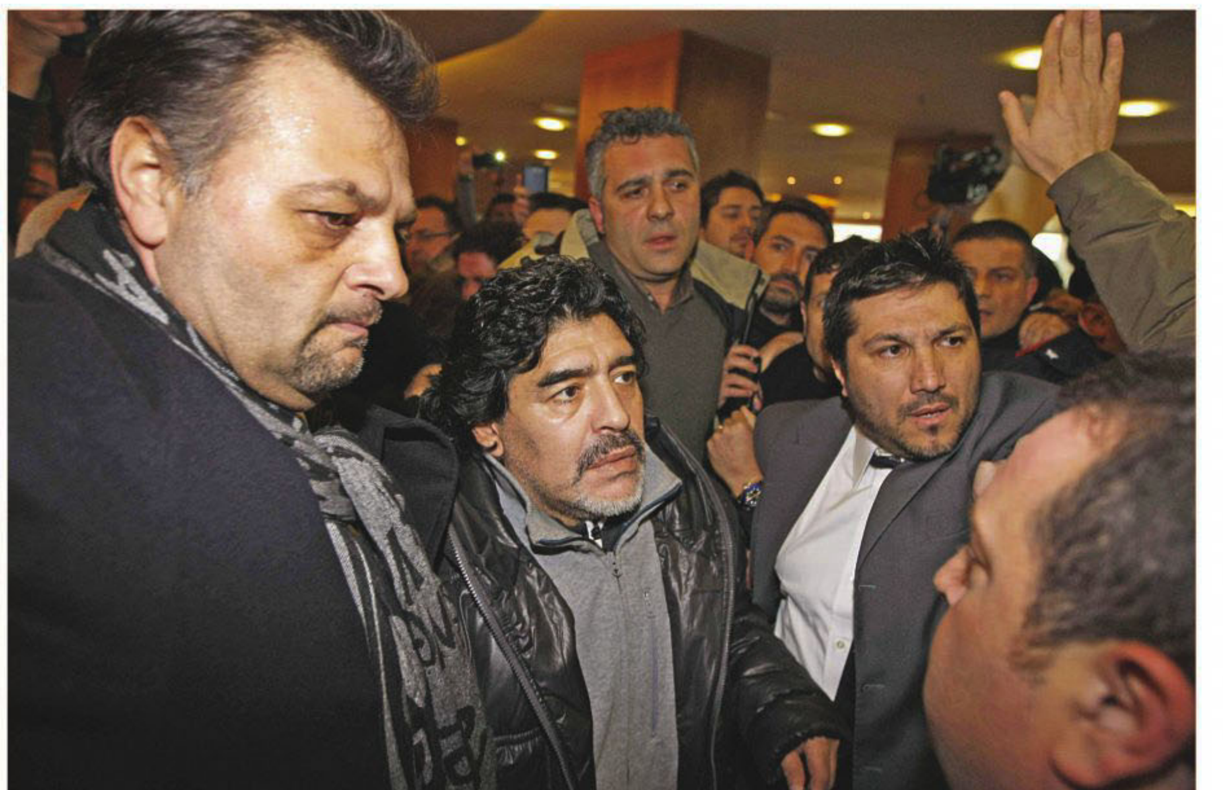
Argentina legend Diego Maradona (C) arrives in Naples on Monday.

AFP, Paris Paris Saint-Germain's new star recruit, English veteran David Beckham, will start in the French Cup round of 16 encounter against rivals Marseille, coach Carlo Ancelotti said on Tuesday. "Yes, Beckham will start in the position of (suspended midfielder) Marco Verratti," Ancelotti told reporters before Wednesday's game. "It's an important position," added Ancelotti. "Beckham must help make the play and defensively have a good tactical position on the pitch - he will have the same things to do as Verratti," said Ancelotti, who believes the 37-year-old still has plenty to offer. "Can he still take corners and freekicks? He has the quality to do so," said the Italian. "Beckham can play a whole match, he has the quality to play in the middle of the park."