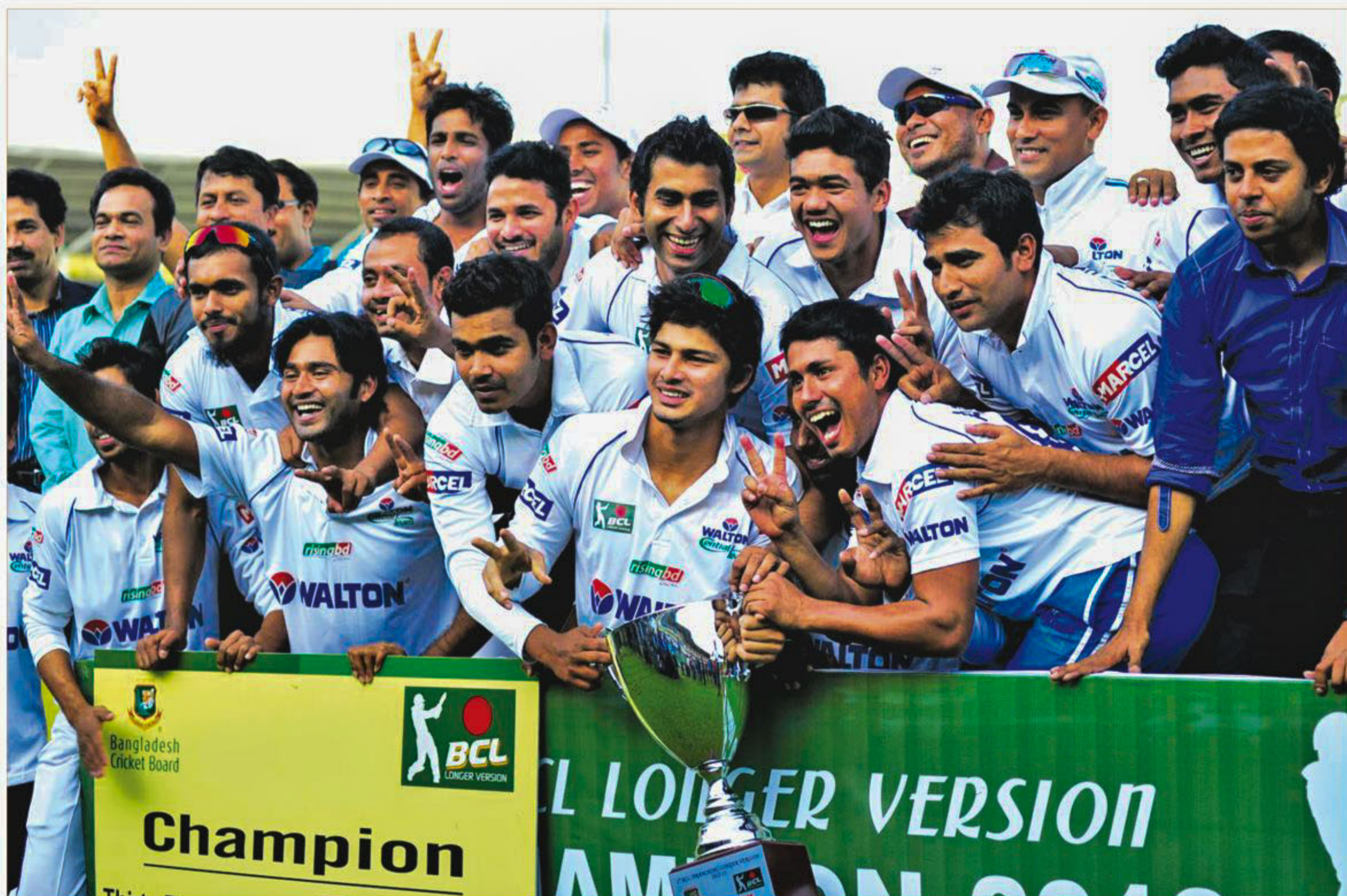
Jubilant Walton Central Zone players hold the Bangladesh Cricket League trophy after beating BCB North Zone by 31 runs in the final at the Sher-e-Bangla National Stadium in Mirpur yesterday.