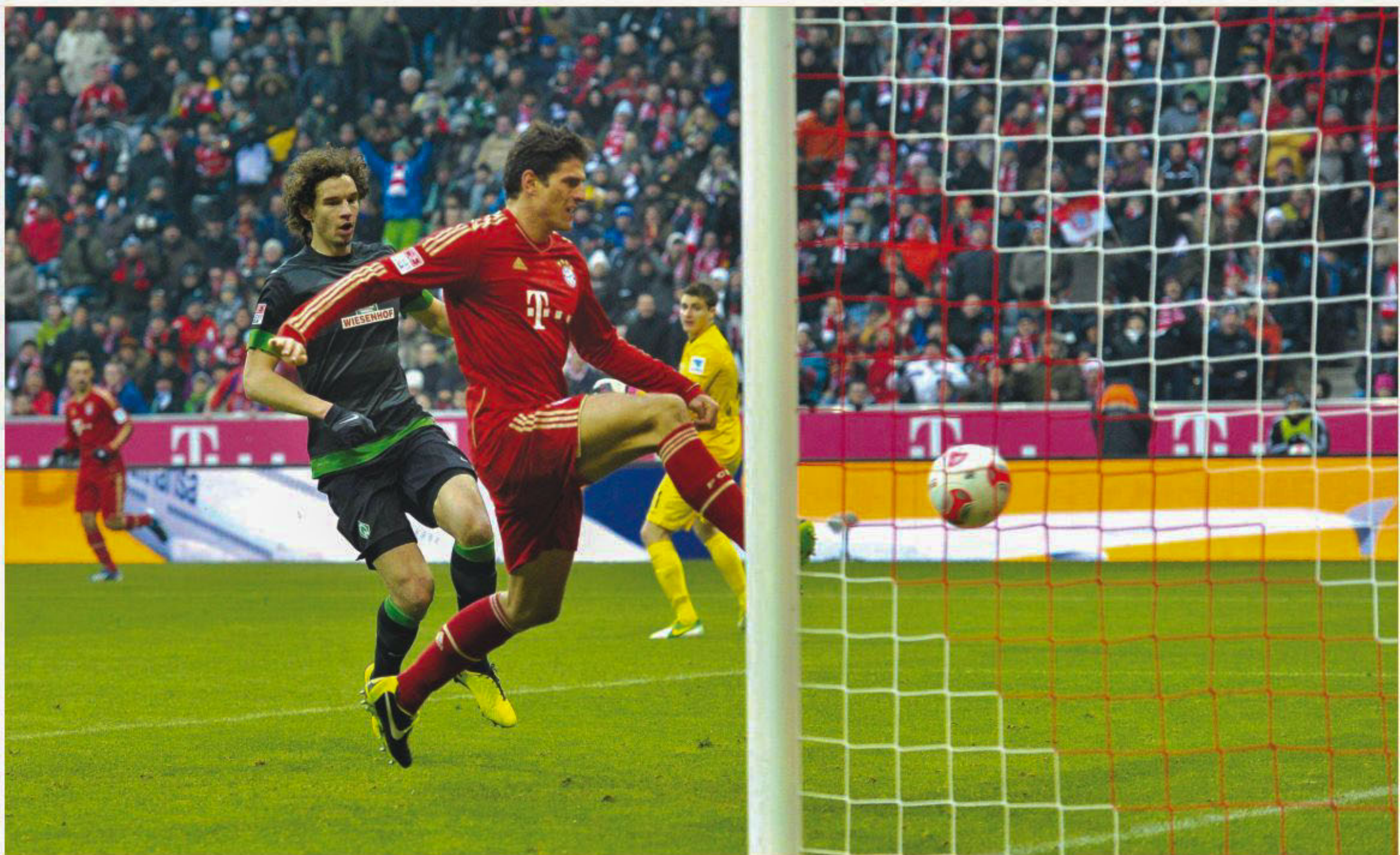
Bayern Munich striker Mario Gomez (R) scores one of his two goals during their Bundesliga clash against Werder Bremen on Sunday.

Belgium midfielder Kevin de Bruyne, on loan at Bremen from Chelsea, pulled a goal back for