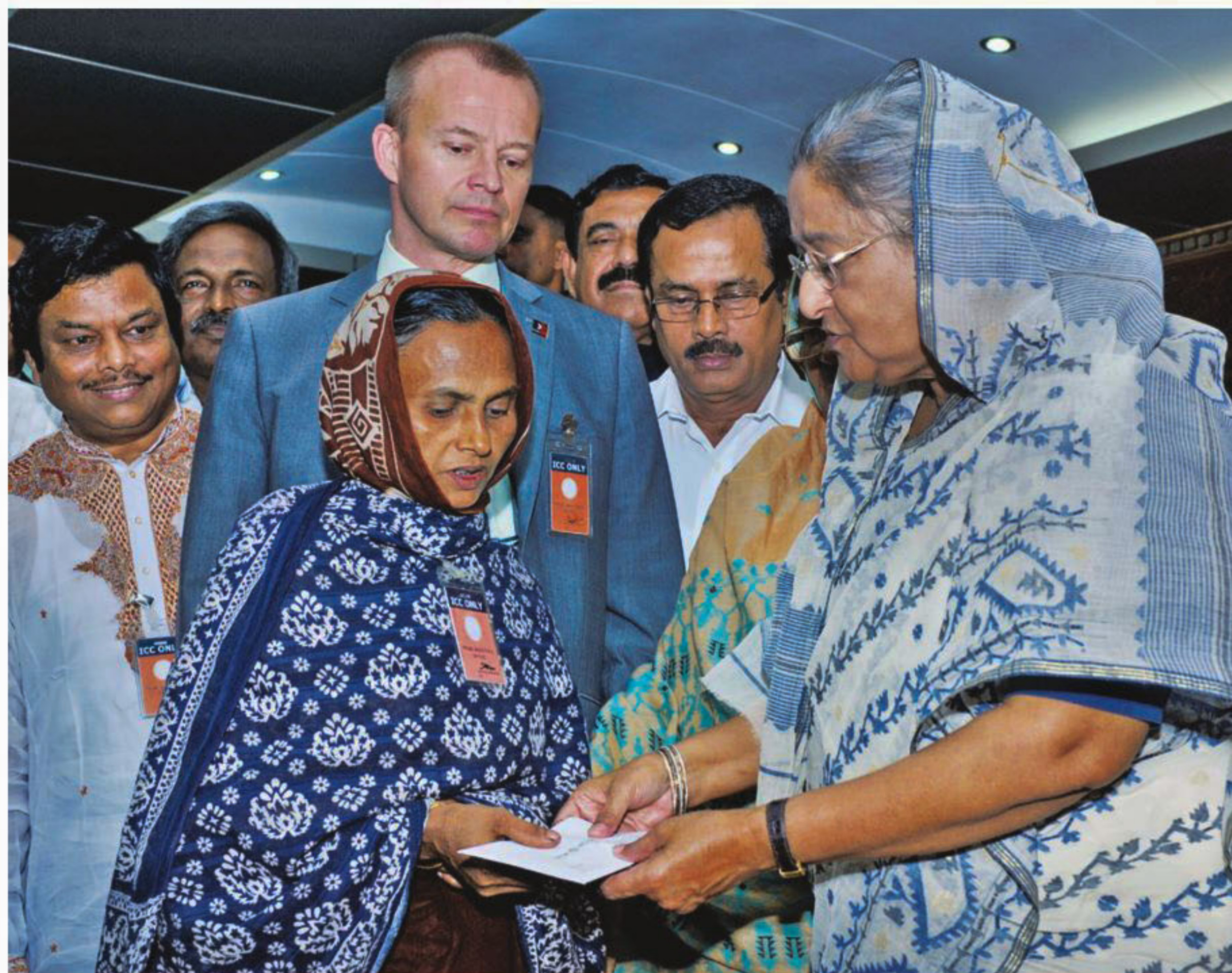
Prime Minister Sheikh Hasina hands over a compensation cheque to a family member of a victim of fire at Smart Export Garment Ltd in the Prime Minister's Office yesterday. Seven workers died in a blaze at the garment factory in the capital's Mohammadpur area on January 26.

Through the 5th and 7th constitutional amendments, all actions, including promulgation of the ordinances of the martial law regimes by Gen Ziaur Rahman and HM Ershad, were ratified and validated. The House in June 2011, after the Supreme Court declared the amendments illegal and void, deleted the two amendments' provisions through the passage of the 15th amendment. But in the last 19 months, the law ministry did not take any step in this regard. Amid such a situation, the committee seemed to have found no alternative but to give consent to the passage of the two bills. The committee, however, expected that the ministries concerned would examine the ordinances and come up with separate bills to replace those which need to be kept. Aiming to avert criticism, the committee recommended new provisions in the bills, saying passage of the bills would not be considered as giving confirmation and ratification to any action done by the illegal and unconstitutional martial law regimes.