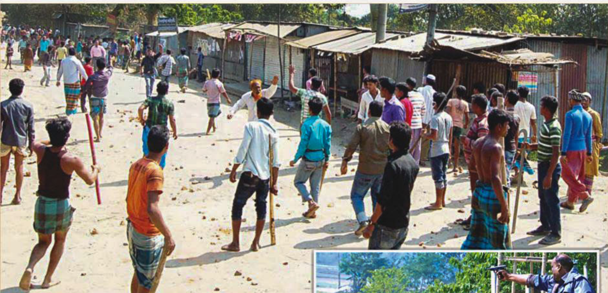
Pickets pelt police with brick chips at Gobindaganj of Manikganj during yesterday's hartal. Their attack forced police to retaliate with gunfire, which left four dead. Inset, a policeman fires his sidearm while holding a hokey stick a picket had dropped.