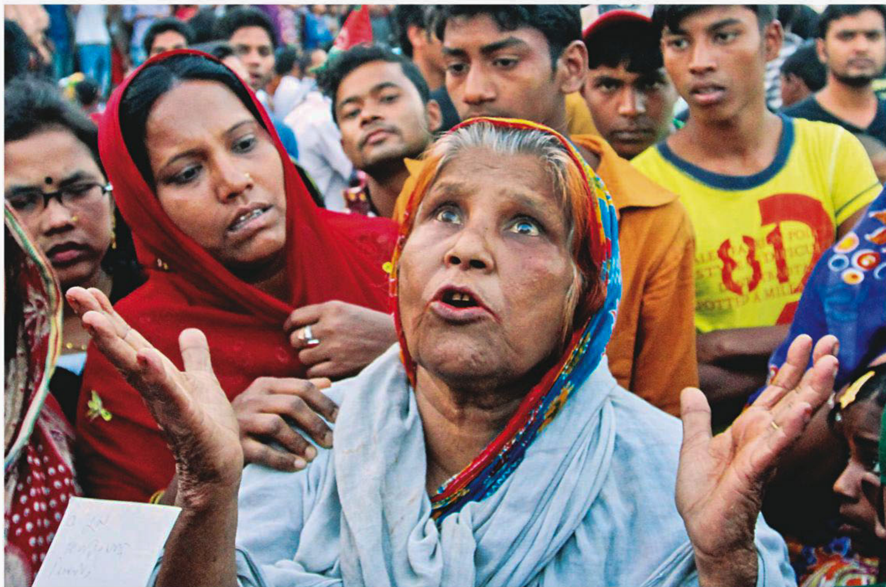
An elderly woman narrates to the participants of yesterday's Gonojagoron Mancha rally at Rayerbazar how the collaborators of Pakistani occupation army killed her husband at the capital's Darus Salam in 1971.

Leaders of the Awami League-led 14-party alliance yesterday urged people to reject today's hartal of eight Islamist parties like the last hartal of Jamaat. Speaking at a protest rally, they said Jamaat-e-Islami played a strong role behind the mayhem unleashed by the Islamist parties on Friday across the country to free the war criminals from jail and hamper the operations of the war crimes tribunals. Ramna thana unit of the alliance organised the rally on Bangabandhu