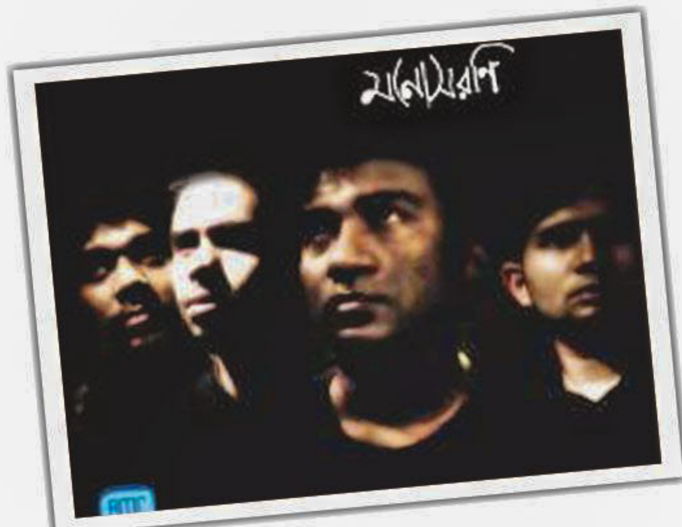
Cover jacket of the album.